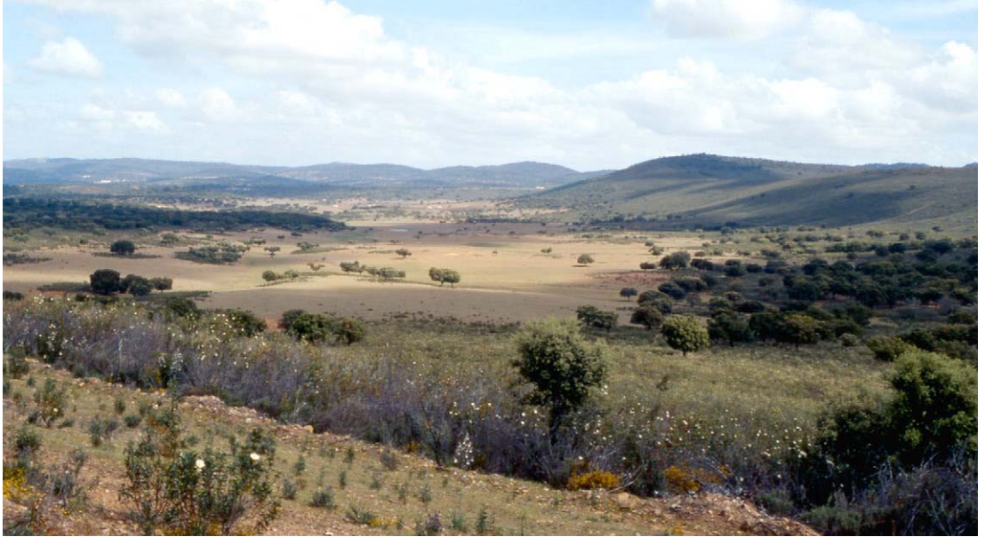
Figure 4. Typical habitat of Cinereous Vulture in Sierra de San Pedro with the nesting area (at the right) and feeding area (at the left).

Junta de Castilla y León, Regional Authorities of Castilla y León). In the Extremadura, domestic pigs and Wild Boar are abundant but their relative importance in the vulture's diet is difficult to assess because of problems of differentiating them in pellets. The pig-farming sector in Extremadura is represented by 1.3 million animals, mostly in a free-range regime in the proximities of vulture colonies (MAPA 2002). The situation of Wild Boar is similar to that described above for Red Deer (Saez-Royuela & Telleria 1986, León 1991).