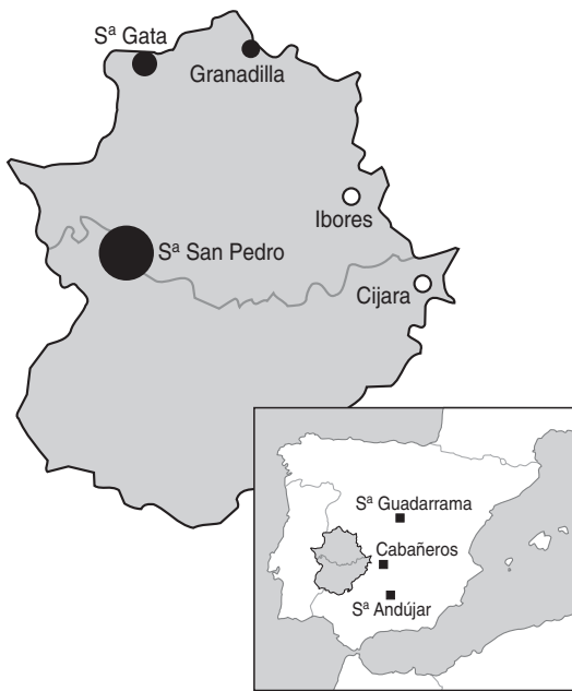
Figure 1. Map of Extremadura (Spain) and Iberian Peninsula showing the location of the studied colonies. Colonies in Extremadura are indicated by circles (closed: colonies included in analyses; open: colonies not included in analyses), and by squares in the rest of the Iberian Peninsula. Cabañeros data (Guzmán & Jiménez 1998); Sierra de Andújar data (Moleón et al. 2001); Sierra de Guadarrama data (Grefa 2004).

second the numbers were 0.12 and 3.17 km, respectively. For comparison, the furthest distance between nests of the whole San Pedro colony was greater than 50 km.