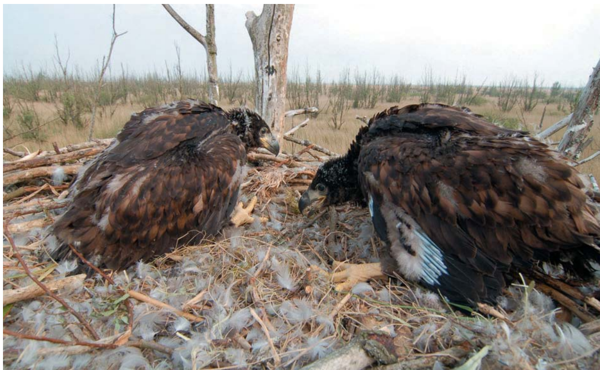
Figure 2. Nest of White-tailed Eagle in the Oostvaardersplassen on 15 May 2008, with view across the marshes showing reedbeds and extensive die-back of willows. This third successful nest produced two fledglings.

by desiccation. Prolonged droughts have a profound negative impact on the survival of Palearctic migratory birds, but this is remedied as soon as rainfall improves (Zwarts et al. 2009). Similarly, the rehabilitation of the Waza Logone floodplains in northern Cameroon was accompanied by increasing numbers of waterbirds, although improved rainfall after the disastrously dry 1980s and colony protection also played a role in this development (Scholte 2006). Even more recently the Mesopotamian marshes of Iraq, once covering 15,000 km 2 of which in 2000 less than 10% remained, have shown a remarkable recovery after dikes were breached and a high volume of good-quality water from the Tigris and Euphrate reflooded 39% of the former marshes. Although it is still too early to celebrate the recovery of this mutilated marshland (and “the stillness of a world that never knew an engine” described in Wilfred Thesinger’s The Marsh Arabs – based on his stay from the end of 1951 until June 1958 – is unlikely to return), the resilience shown by macroinvertebrates, macrophytes, fish and birds is promising (Richardson & Hussain 2006). Suchlike examples of rebounding wetlands are known from all over the world, although they are offset by many more examples of loss (Boere et al. 2006).