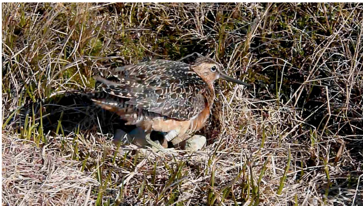
Figure 2. Still shot from video footage of the Long-billed Dowitcher flushing from the nest; video taken on 22 June 2011.

typical of shorebirds incubating a nest (Simmons 1952). The following day between 15:00 and 15:30 h we videotaped the bird with a digital camera from a minimum distance of 3 m as it incubated the nest and flushed when we approached (Figure 2). The bird flew only a few meters away from the nest and returned to it immediately once we moved away; seven minutes later we recorded a second video of the incubating bird.