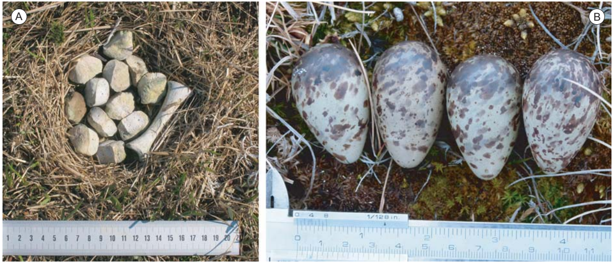
Figure 1. (A) The Long-billed Dowitcher 'clutch' of twelve intervertebral discs and one elongated bone of an unidentified mammal; photo taken on 26 June 2011. (B) Normal clutch from a Long-billed Dowitcher nest at the study site.

Upon our approach, the dowitcher flushed from the nest and displayed rodent run distraction behaviour