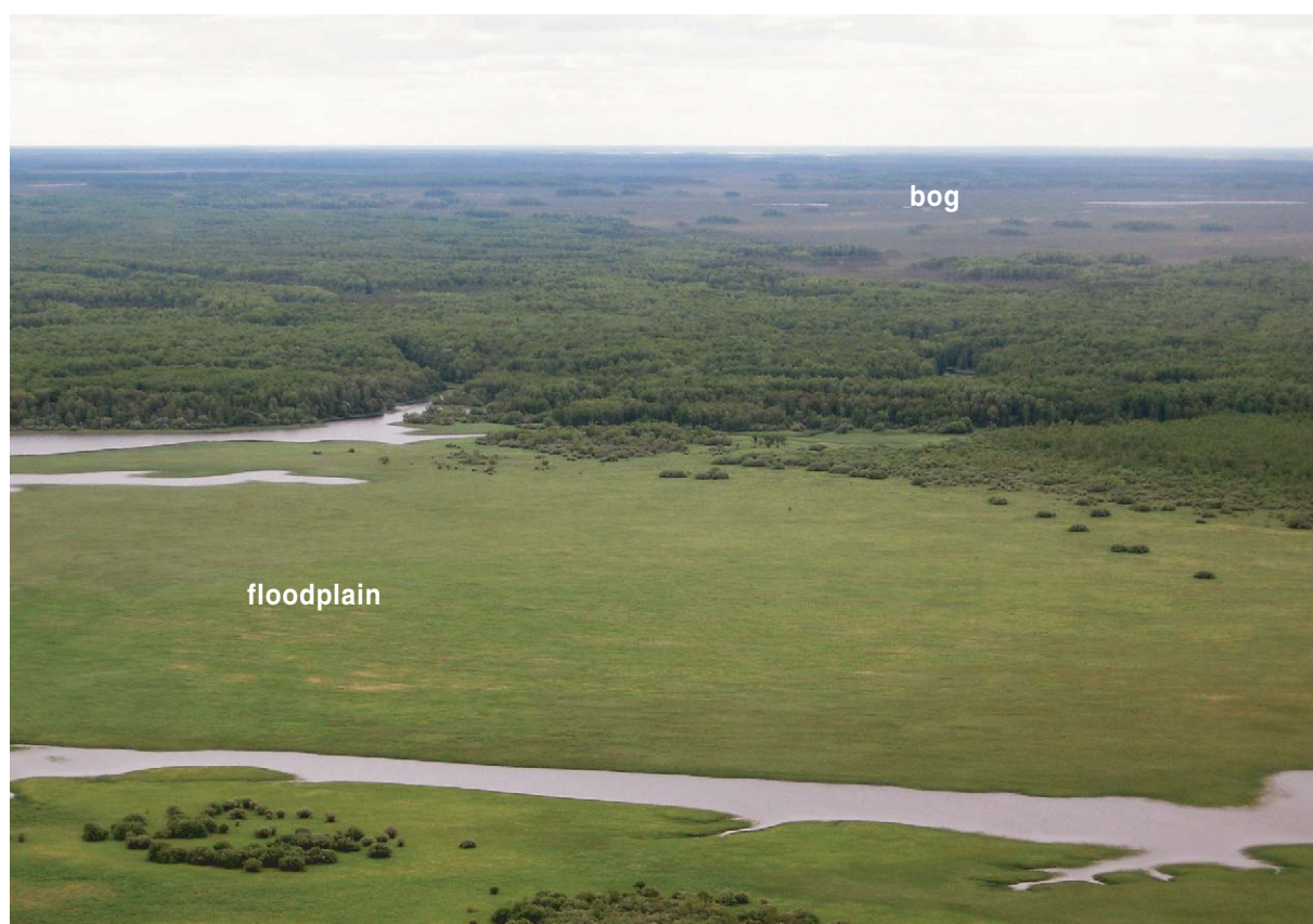
Figure 2. Floodplain and bog are separated by 1.5–2 km of forest near Mukhrino Field Station, where thunbergi and beema occur on either side of the forest ecotone.

allocated in a broad zone of sympatry of both taxa, which in Western Siberia is roughly between 55°–60°N (Red'kin 2001, Ryabitsev 2008). Since thunbergi and beema are long-distance migrants (Glutz von Blotzheim & Bauer 1985) we are keen to distinguish occasional migrants from breeding birds. Migrants can turn up in any damp habitat, a potential pitfall when studying the birds' breeding habitat. To minimize confusion we decided to only use observations of feeding or strongly alarming parents, indicating the presence of (fledged) juveniles. Upon finding birds meeting our criteria we established their sub-specific identity. Fortunately, males of both taxa are easy to separate in the field: thunbergi males have a distinctive all dark head and a yellow throat, whereas beema males have a light, blue-grey head, a strong supercilium and a white throat (Alström & Mild 2003). There is controversy over the taxonomic status of dark-headed birds east of the Ural Mountains. These birds are widely recognized as belonging to the taxon plexa (Tyler 2004) but the validity of the taxon has been a subject of debate. Alström &