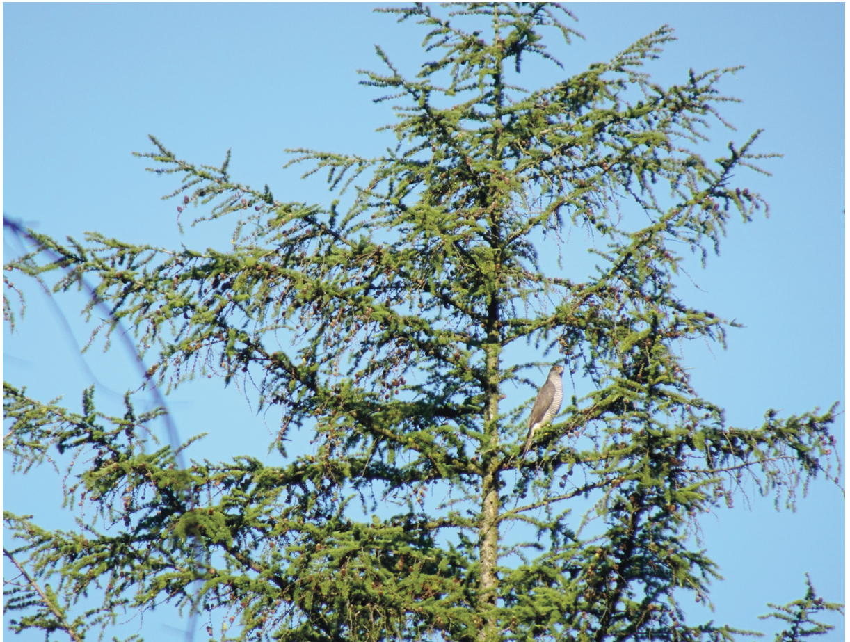
Adult female Northern Goshawk on high alert in a larch some 75 m away from her nest with three chicks of 21–22 days old. The nest visit (for ringing and taking biometry) took 20 minutes, before, during and after which the female was present but completely silent (photo Rob G. Bijlsma, Forestry of Smilde, 10 June 2023).

the mass range of 75–500 g have been recorded. Many of those species depend on farmland for food, like Common Woodpigeon Columba palumbus and Common Starling Sturnus vulgaris . (The epitaph ‘common’ is a fair reminder of past days.) For example, in woodlands on sandy soils in The Netherlands biomass of medium-weight bird species declined by a whopping 75% or more between the 1960s and 2010s in summer, and an even larger decline occurred in winter (Bijlsma 2020). Similar trends in raptor numbers, reproductive output and prey biomass have been noted in other Western European countries, e.g. in Denmark (Nielsen et al. 2023) and in Germany (Muskens et al. 2016, Looft 2017, Reibisch et al. 2021). In these regions, just as in the eastern Netherlands, Common Buzzard, Eurasian Sparrowhawk and Northern Goshawk initially recovered and increased after the use of organochlorines in agriculture was banned, but all three species started to decline after the early 2000s.