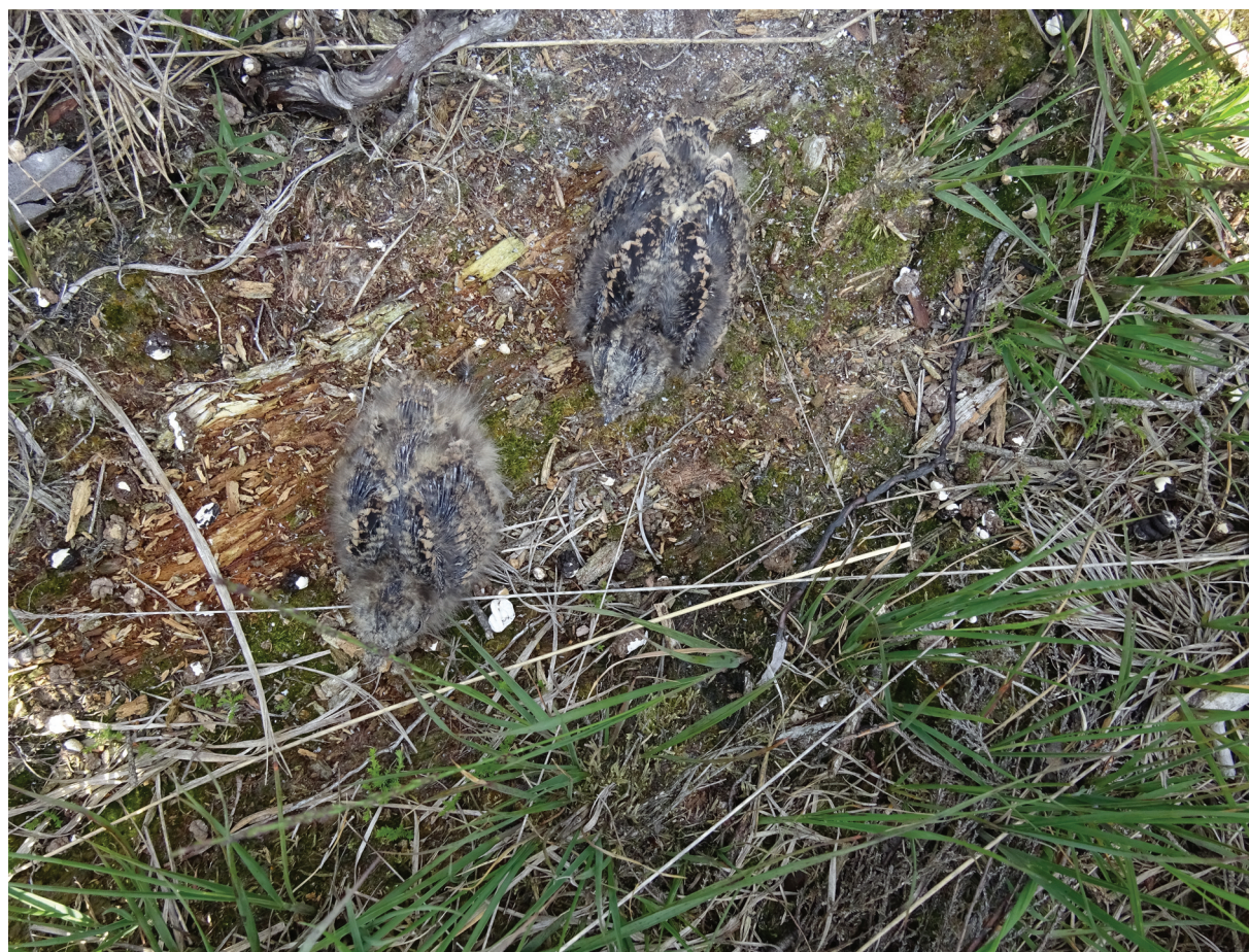
Typical nest of European Nightjar, the 11–12-day old chicks are surrounded by faecal sacs (white blobs) which can be used to investigate diet (Forestry of Smilde, Drenthe, 2 August 2017).

Without basic monitoring of the natural world none of these worrying trends could have been quantified and presented to the public and governmental authorities. Vast insect declines tell us something about the environment that transcends insects: we are poisoning the living world on a massive scale. How exactly insect crashes cascade into higher trophic levels is less easy to elucidate, not least because profound environmental changes across the globe are working in concert. What is particularly worrying is not so much the fact that we