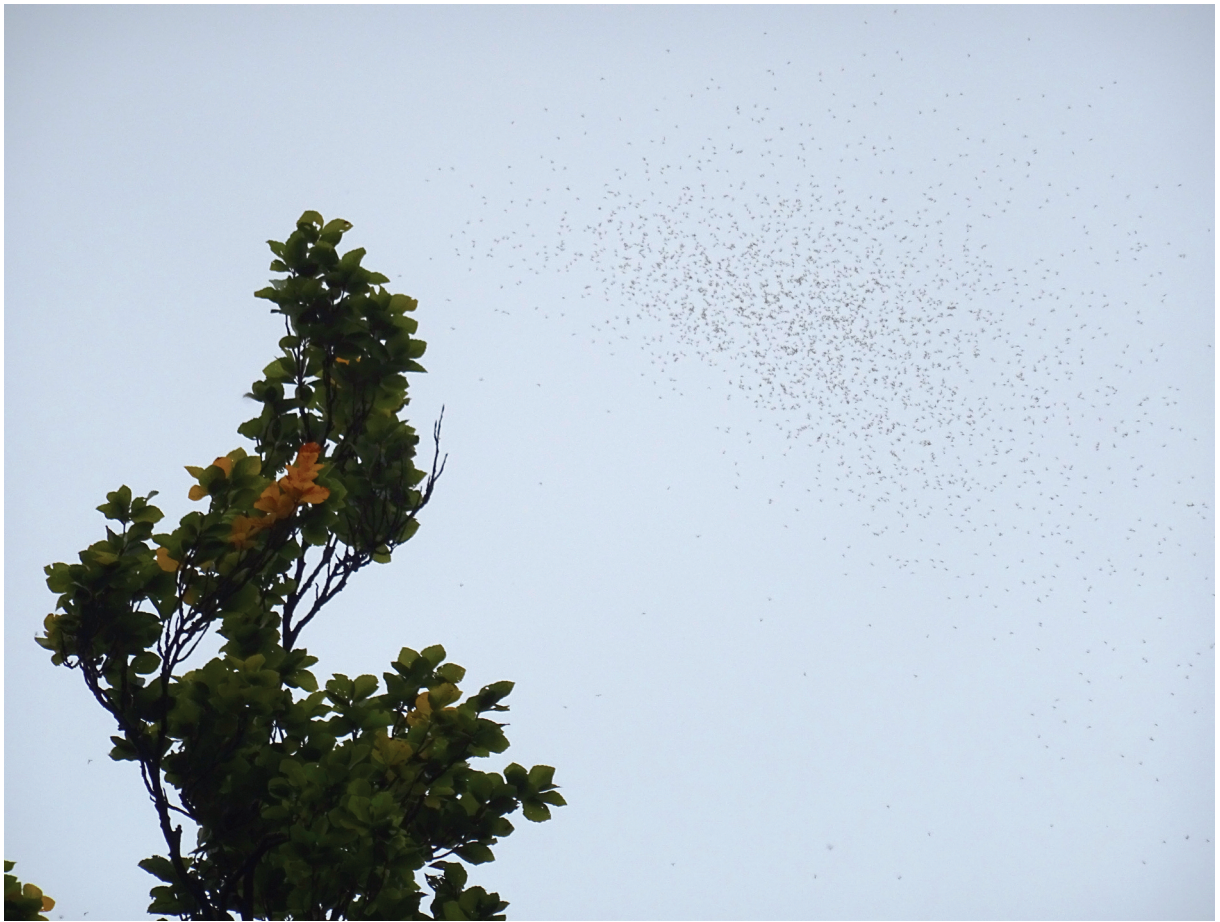
The observer in a tree top used to see dancing mosquito swarms all over the forest, often towering above his own head, but those times are no more. Insects have declined dramatically, including chironimidae (photo Rob G. Bijlsma, Bokkenleegte, Drenthe, 23 September 2019).

impact on populations of insectivorous passerines is surprisingly small and contradictory, with increases and declines within families and within habitats. The Willow Warbler Phylloscopus trochilus , for example, shows a decline, whereas its close relative Chiffchaff P. collybita is increasing. And what about Goldcrest Regulus regulus (decline) compared to Firecrest R. ignicapillus (increase)? Why is European Nightjar Caprimulgus europaeus at the moment commoner than ever before in the past half century, when its steep decline in the 1970s and 1980s was cause for concern? This is especially counter-intuitive because breeding is largely confined to nature reserves, where insect declines in 1989–2016 amounted to 75% in biomass (Hallman et al. 2017). Among the insects adversely affected, moths are high on the list (review in Sánchez-Bayo & Wyckhuys 2019). Moths also figure prominently in diets of Nightjars: >80% of the food studied in the