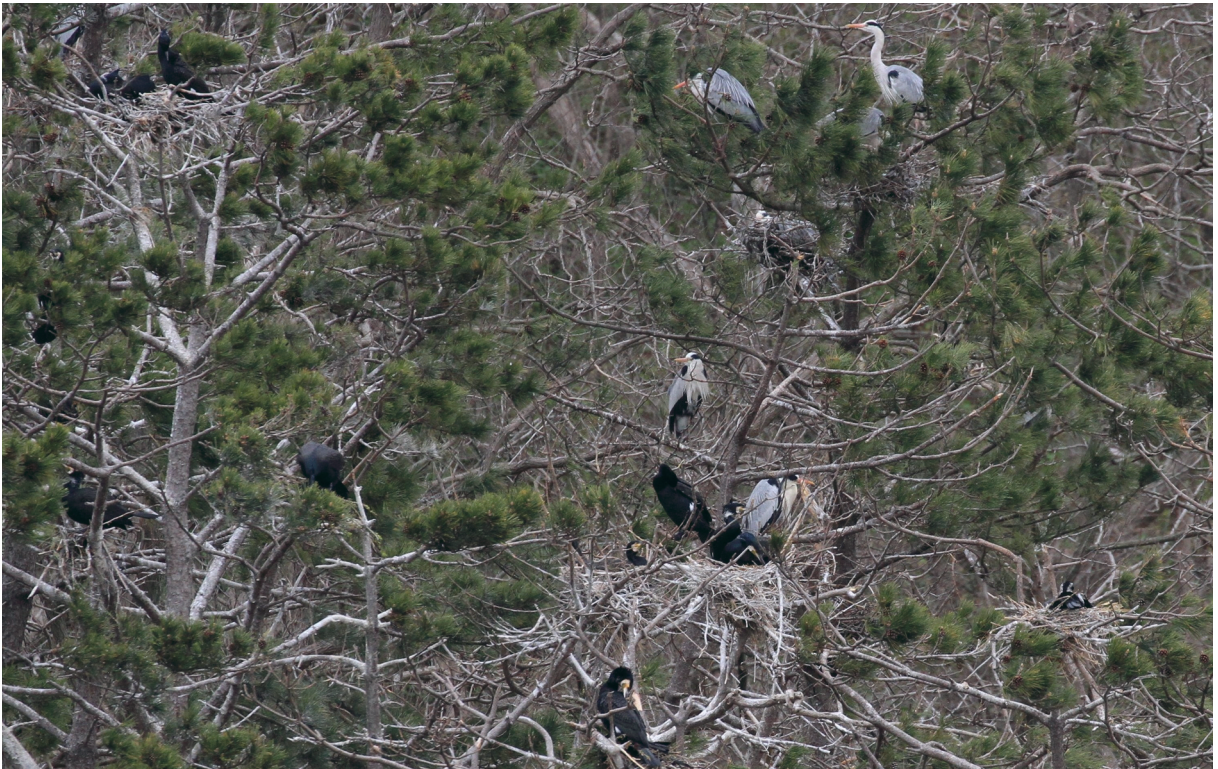
Mixed-species colony of Great Cormorants and Grey Herons at the study site in Aomori, Japan (19 April 2016).

‘staying on nest’ (a bird perched on its own nest or on a branch near the nest) or ‘approaching the predator’ (a bird left its own nest and perched on a branch near the predator). In addition, we considered alarm call and intimidation as aggressive behaviours. For the analysis, we used all birds that were within a 5-m radius of the predator when the predator appeared.