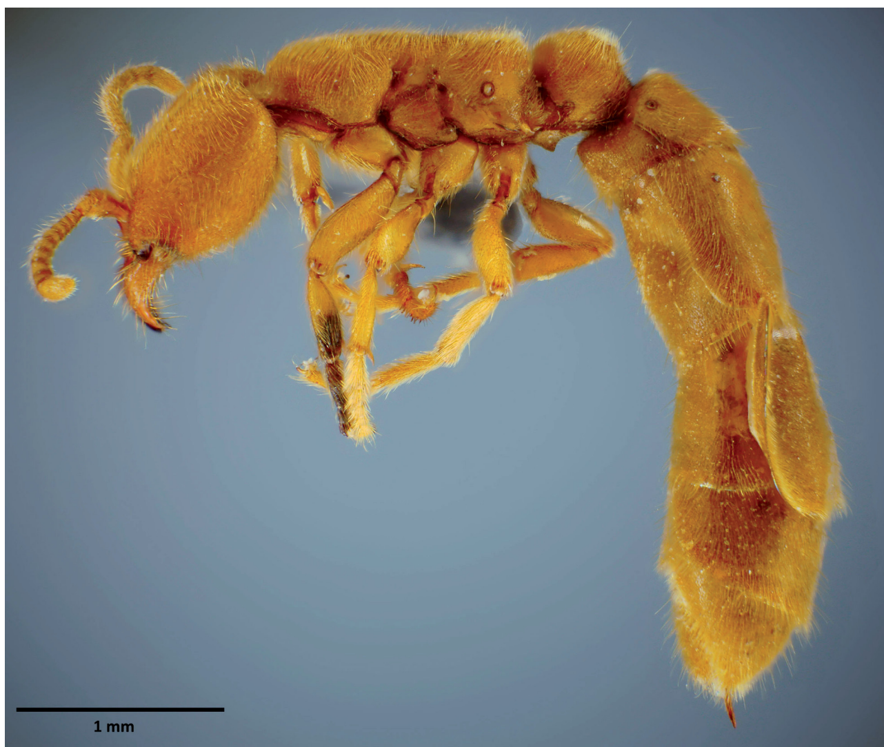
Fig. 1. Subdichthadiigyne of Yunodorylus doryloides (colony no. RS-55-LMB16; individual no. SEMUT20170111B), body in lateral view.

depression (blue arrow in Fig. 2C); mesosoma in dorsal view distinctly longer than broad; anterior margin of mesopleuron weakly convex, but not forming a distinct lobe (red arrow in Fig. 2D); metapleural gland orifice concealed beneath a ventrolaterally directed cuticular flange; propodeum with a pair of faintly and bluntly produced posterodorsolateral corners, in posterodorsal view with a faint median longitudinal depression; an endophragmal pit distinct on the lateral face of propodeum (blue arrow in Fig. 2D); propodeal lobe very low; mesotibia and metatibia with a small simple spur in front of a large pectinate spurs; inner margin of pretarsal claws of all legs without teeth; metatibial gland absent; waist consisting of a single small segment (petiole); petiole without tergosternal fusion, in dorsal view much broader than long, broadest a little behind midlength of petiole, with anterior margin weakly concave and lateral margins weakly convex; subpetiolar process developed