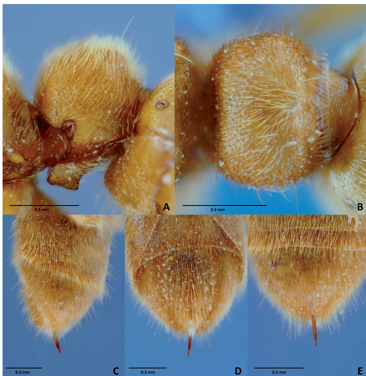
Fig. 4. Subdichthadii-gyne of Yunodorylus doryloides (colony no. RS-55-LMB16; individual no. SEMUT20170111B). (A) Petiole in lateral view. (B) Petiole in dorsal view. (C) Apex of gaster in lateral view. (D) Hypopygium in ventral view. (E) Pygidium in dorsal view.

Dorylinae (Hymenoptera, Formicidae). ZooKeys 608: 1-280.