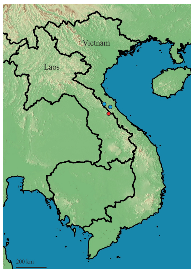
Fig. 1. Map showing the distribution of Gracixalus quyeti , including the localities of the type series after Nguyen et al. (2008) in Quang Binh Province, Vietnam (marked with blue dots) and our first record from Khammouane Province, Laos (marked with a red dot).