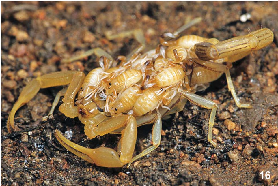
Figs 15, 16. Uroplectes adults, habitus in life: (15) U. gracilior Hewitt, 1913, male; (16) U. planimanus (Karsch, 1879), female with brood.