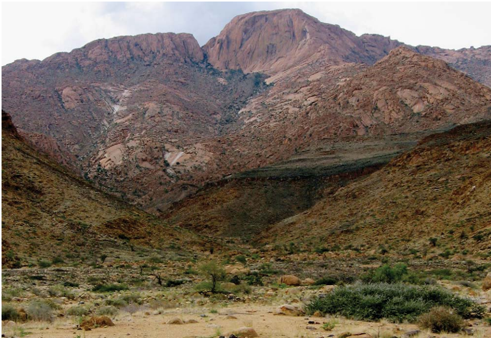
Fig. 4. Brandberg Massif (Namibia), base of Massif at entrance to Goaseb (Ga-Asab) Gorge, facing north to Orabeskopf at summit, wet year. Dominant vegetation, Boscia foetida Schinz and Commiphora sp. Rocky flats, habitat of Hottentotta conspersus (Thorell, 1876), Parabuthus brevimanus (Thorell, 1876), Parabuthus villosus (Peters, 1862), and Opisthophthalmus lamoralis Prendini, 2000.