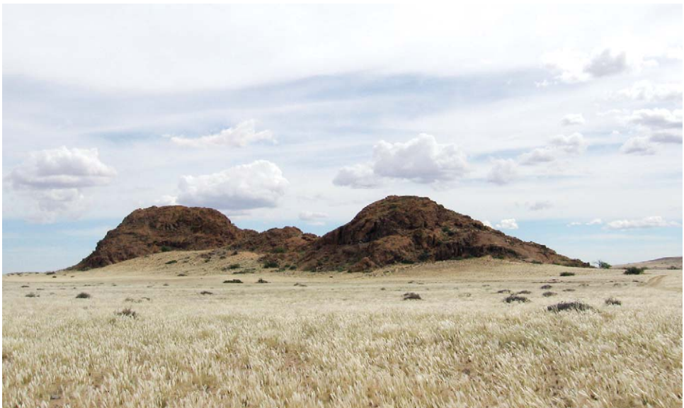
Fig. 2. Brandberg Massif (Namibia), granitic inselberg south, surrounded by low sand dunes, leading down to sandy plain, facing west, wet year. Dominant vegetation, Euphorbia damarana L.C. Leach and Stipagrostis sp. Dunes, habitat of Parabuthus gracilis Lamoral, 1979 and Opisthophthalmus jenseni (Lamoral, 1972). Sandy plain, habitat of Parabuthus brevipennis (Thorell, 1876), Parabuthus granulatus (Ehrenberg, 1831) and Opisthophthalmus wahlbergii (Thorell, 1876).