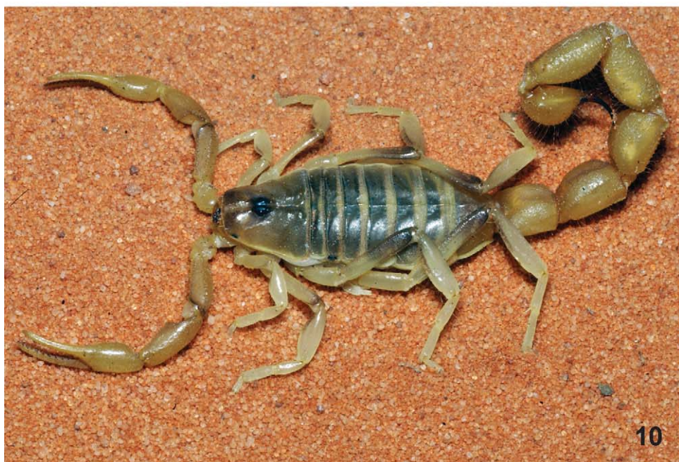
Figs 9, 10. Adult females, habitus in life: (9) Hottentotta conspersus (Thorell, 1876); (10) Parabuthus brevimanus (Thorell, 1876).