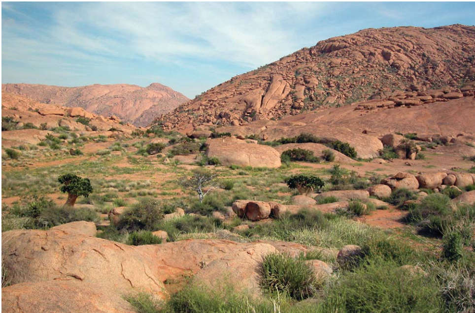
Fig. 8. Brandberg Massif (Namibia), Wasserfallfläche, plateau on summit of Massif, facing southwest, wet year. Dominant vegetation, Boscia albitrunca (Burch.) Gilg & Gilg-Ben., Cyphostemma currorii (Hook.f.) Desc. and Euphorbia sp. Rocky flats and slopes, habitat of Lisposoma elegans Lawrence, 1928, Hadogenes tityrus (Simon, 1888) and Uroplectes planimanus (Karsch, 1879). Sandy flats, habitat of Parabuthus brevimanus (Thorell, 1876) and Opisthophthalmus carinatus (Peters, 1861). Woody vegetation, habitat of Uroplectes otjimbinguensis (Karsch, 1879).