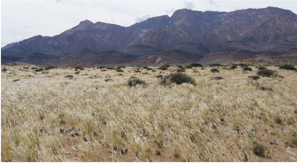
Fig. 3. Brandberg Massif (Namibia), gravel plains and foothills southeast, facing northwest to Massif, wet year. Dominant vegetation, Euphorbia damarana L.C. Leach and Stipagrostis sp. Gravel plain, habitat of Parabuthus brevimanus (Thorell, 1876), Parabuthus granulatus (Ehrenberg, 1831). Rocky foothills, habitat of Parabuthus villosus (Peters, 1862) and Opisthophthalmus lamoralis Prendini, 2000.