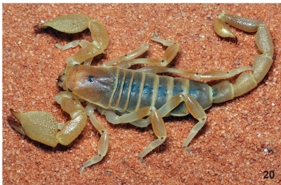
Figs 19, 20. Opisthophthalmus adult males, habitus in life: (19) O. lamorali Prendini, 2000; (20) O. jenseni (Lamoral, 1972).