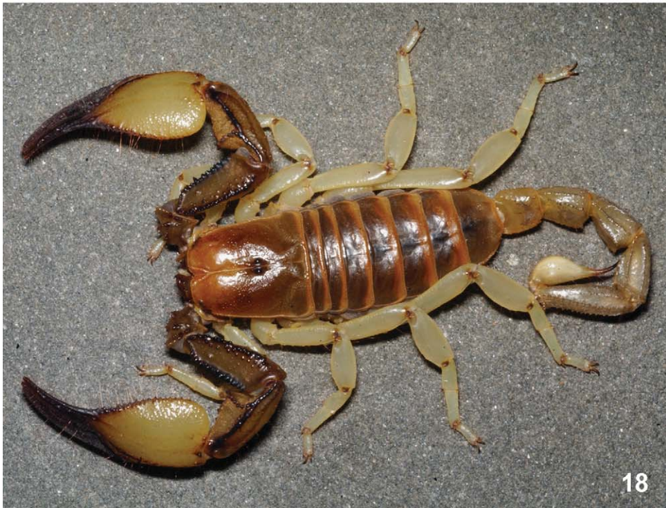
Figs 17, 18. Adult males, habitus in life: (17) Hadogenes tityrus (Simon, 1888); (18) Opisthophthalmus carinatus (Peters, 1861).