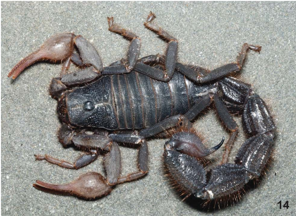
Figs 13, 14. Parabuthus adults, habitus in life: (13) P. kraepelini Werner, 1902, female; (14) P. villosus (Peters, 1862), male.