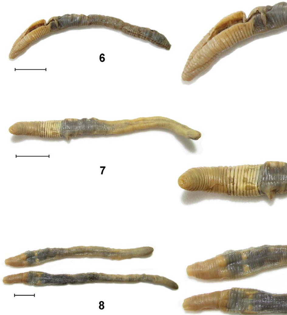
Figs 6–8. Habitus and enlarged clitellar area of Proandricus species: (6) P. adami , (7) P. amphius , (8) P. oresbiosus . Scale bars = 1 cm.

The Mont-aux-Sources area, located in the northern part of the central Drakensberg, is adjacent to the Royal Natal National Park, and the new collecting site lies in the