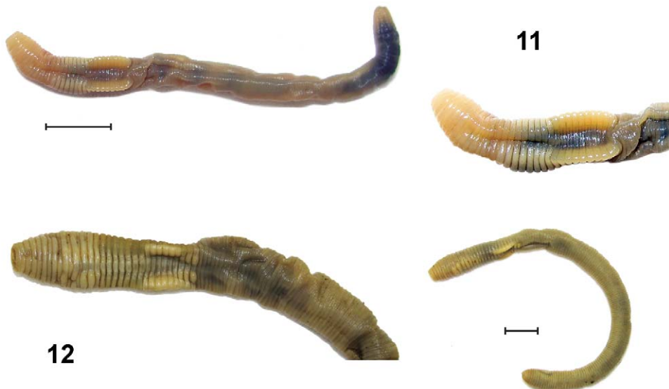
Figs 11, 12. Habitus and enlarged clitellar area of Geogenia distasmosa (11) and G. quaera (12). Scale bars = 1 cm.

Unfortunately, the type specimen NMSA/Olig.03907 is in unsatisfactory condition for examination. From the original species description it is known that one pair of small spermathecae occurs in segment 9, and a single spermatheca at the right side in segment 10. Their spermathecal pores have been observed during species dissection in