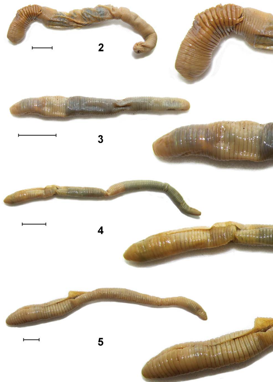
Figs 2–5. Habitus and enlarged clitellar area of Proandricus species: (2) P. lesothoensis , (3) P. pajori , (4) P. bourquini , (5) P. sani . Scale bars = 1 cm.