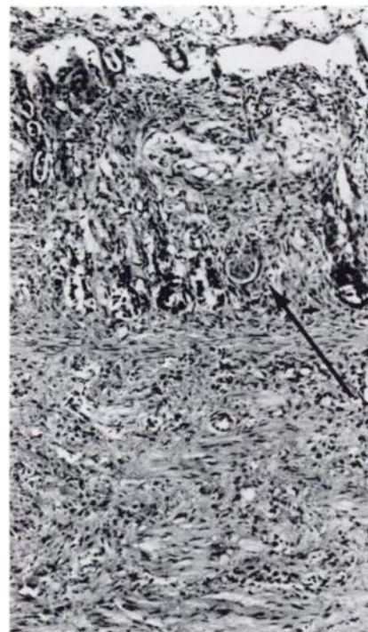
FIGURE 2. Higher magnification of mucosal-submucosal junction of small intestine as in Figure 1. Note marked epithelial loss with remnants in some crypts only, a crypt microabscess (arrow) and cellular accumulation in smooth muscle. H&E \times 90 .

Liver, lung and kidney tissues were submitted for microbiologic examina-