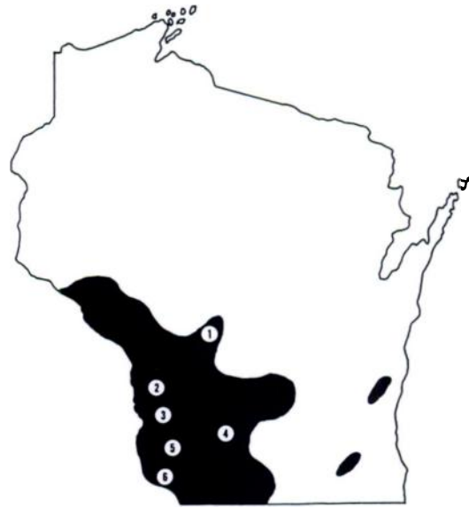
FIGURE 1. Map of Wisconsin showing hunter-check stations where blood samples from wild turkeys were obtained, 1983–1984. Shaded area indicates range of wild turkeys in Wisconsin. Study sites include (1) Necedah, Juneau County; (2) Romance Tavern, Vernon County; (3) Gays Mills, Crawford County; (4) Tower Hill, Iowa County; (5) Boscobel, Grant County; (6) Cassville, Grant County.

Beginning 1 wk postinoculation, blood smears were made twice weekly for 6 to 9 wk, and were stained with Giemsa's stain at pH 7.2 to 7.3 (1:10 dilution for 1 hr). A minimum of 20,000 erythrocytes were examined per slide using oil immersion optics (1,250×). Erythrocyte numbers were estimated by counting the number of erythrocytes in ten random fields per slide, taking the average, and then counting the number of fields observed until a minimum of 20,000