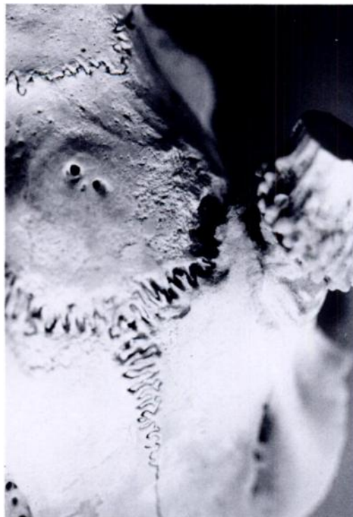
FIGURE 2. Erosion and pitting of the frontal bone and antler pedicel in an adult male white-tailed deer with a cerebral abscess.

may have contributed to development of abscesses were identified (Table 1). Fractured antler pedicels or subcutaneous abscesses around the antler pedicels were each noted in seven bucks. Records for 10 bucks contained specific descriptions of tract-like lesions extending through or between cranial bones. The following were considered contributory to formation of intracranial abscesses in two bucks each (1) subcutaneous abscesses on the head or ears due to ticks ( Amblyomma spp.), (2) bacterial otitis due to ear mites ( Psoroptes cuniculi ), and (3) known or suspected intraspecific trauma.