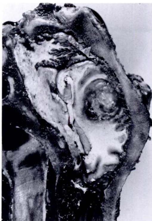
FIGURE 1. Cerebral abscess surrounded by inflammation in the cerebrum of an adult male white-tailed deer.