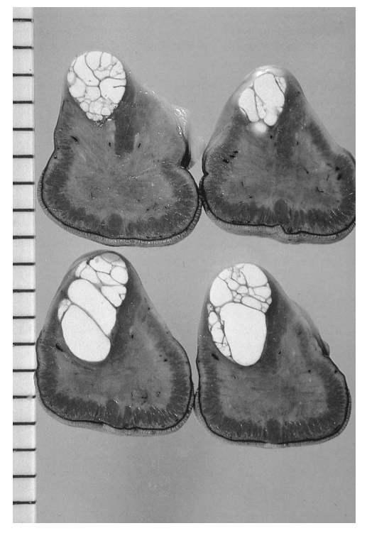
FIGURE 1. Cut section of the lingual nodules from a sitatunga shows multiple loculi with a chalky appearance and a gritty consistency. The loculi are separated by thin fibrous strands. Formalin fixed tissue.

System Model 9100/60, fitted with a microcomputer for spectral processing.