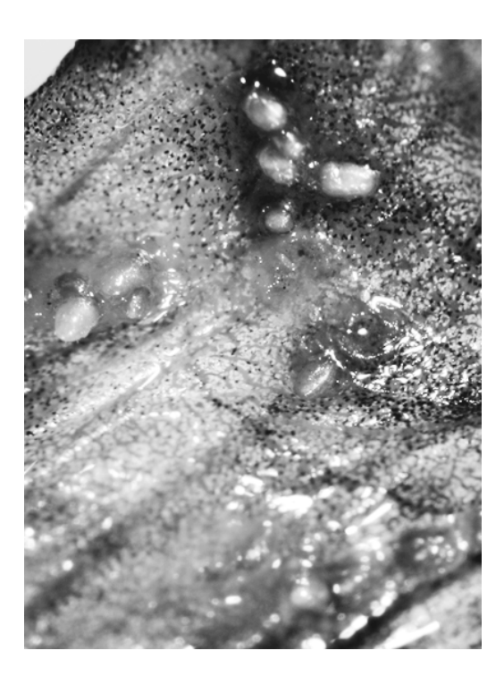
FIGURE 2. Infestation of subadult Spea bombifrons by larval Hannemania sp. (\times 35) from site # 4 in Briscoe County, Texas.

Sympatric amphibian species of Spea spp. were not observed with Hannemania sp. infestations. Spea bombifrons and S. multiplicata together comprised the majority (93%) of captured individuals. Sympatric species of Spea spp. were Ambystoma tigrinum mavortium , Bufo