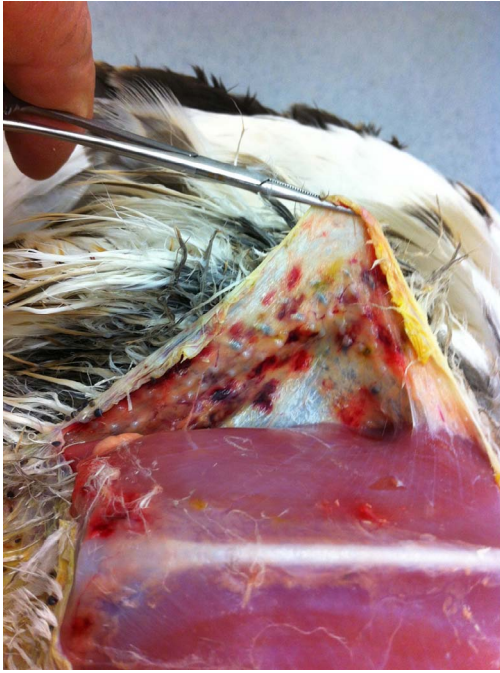
FIGURE 3. The deceased Red-tailed Hawk ( Buteo jamaicensis ) from Tucson, Arizona, USA, August 2014, is shown in the same view as Figure 1, with the ventral skin reflected to demonstrate extensive subcutaneous with hemorrhage and edema associated with Argas (Persicargas) giganteus tick insertion. The penetration of the bite into the underlying musculature is also visible.

Rickettsia , 22 of 54 (41%) ticks were positive, in which four birds were associated with positive ticks in which 30–100% of the individual ticks from these birds tested positive (Table 2). In all cases, ticks testing positive in the gltA screening assay were confirmed as positive in the ompB confirmatory assay. Likewise, the random selection of gltA -negative ticks were also negative in the ompB assay. All gltA sequences were of sufficient quality for a length of approximately 596 nucleotides. In this assessed region, sequences were identical to each other, with three taxa that had an equivalent level of sequence homology in GenBank: uncultured Rickettsia sp. clone (94% query coverage; 99% identity; KF360024), Rickettsia endosymbiont of Haemaphysalis sulcata (94% query coverage; 99% identity; DQ081187), and Rickettsia hoogstraalii isolate Rg-731 (94% query cover-