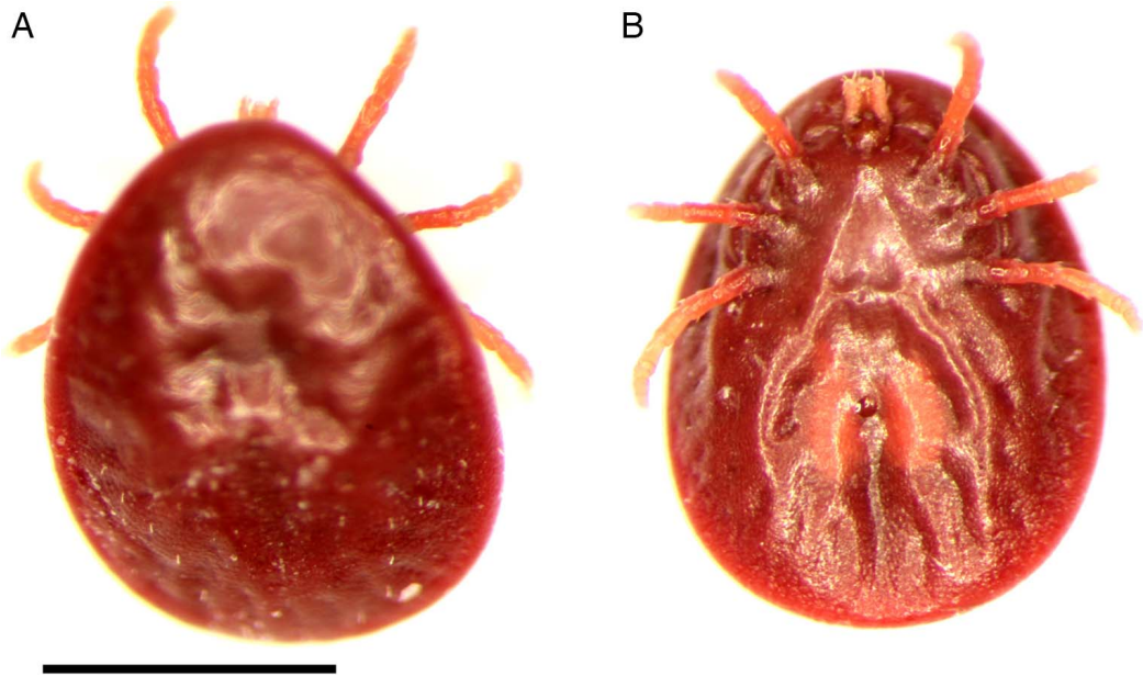
FIGURE 4. Photograph of (A) dorsal and (B) ventral views of a representative Argas (Persicargas) giganteus larval tick, one of many dozens, removed from a moribund Red-tailed Hawk ( Buteo jamaicensis ) in Tucson, Arizona, USA, August 2014. Scale bar=1 mm.

per year), and no infested bird showed paralysis prior to this investigation. In years 2009–13 records indicated similar ticks were noted on other birds, but data were not collected and no specimens of ticks were collected.