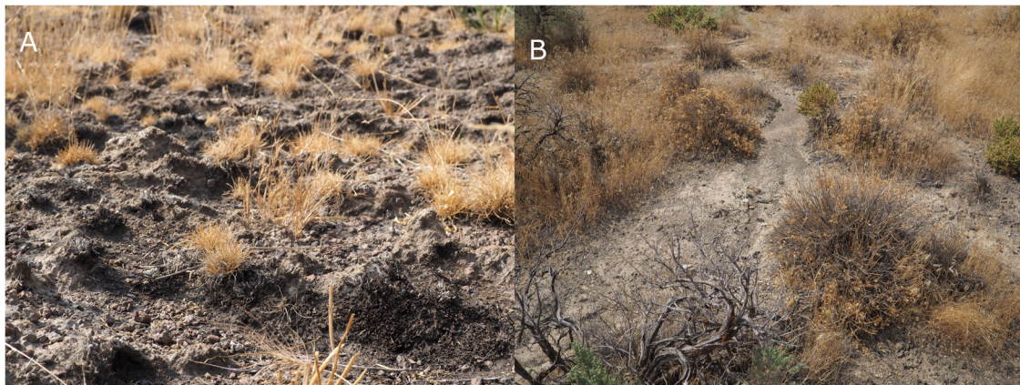
Figure 3. A, Pedestaled bunchgrasses indicating water and/or wind erosion. B, Water flow patterns indicating overland flow.

are useful for building understanding of resource issues and developing shared stewardship goals. 20 A shared understanding of resource issues and vision for the future can lead to identifying more effective management solutions and inspire commitment to implementing those solutions over the long term. 21