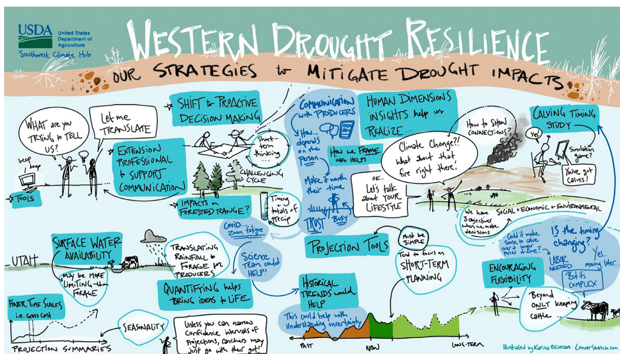
Figure 3. Group discussion captured by graphic illustrator present at the workshop (Karina Branson, ConverSketch).

ature. We walked through the methods for this step, which included examining an inclusive suite of different climate projections, 20-22 as well as quantifying the degree and duration (i.e., exposure) of past and future drought. 23-25 We then presented our results by region to highlight the diversity in drought manifestation. We explained that while temperature is likely to increase across all regions, precipitation and soil moisture display more variability. For instance, we described the northern mixed prairies and cold deserts of the western United States (Fig. 2) will experience an increase in winter and spring soil moisture, although relatively unchanged summer and fall soil moisture. In California's annual rangeland region, we suggested more frequent extreme drought during the winter, but slightly wetter average spring and summer conditions. We explained that spring soil moisture is likely to decline in the hot deserts region, but differ in projections for soil moisture change for other seasons in both the hot deserts and shortgrass steppe.