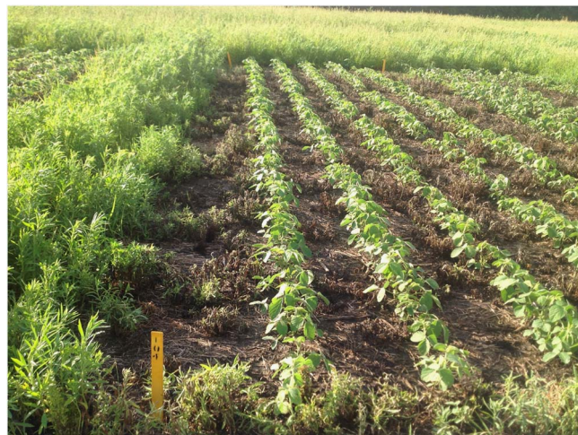
Figure 3. Herbicide program in Enlist E3™ soybean for control of glyphosate-resistant Sumatran fleabane in Argentina. The study is based on a preplant foundation treatment of glyphosate DMA at 1,200 g ha -1 plus diclosulam at 25.2 g ha -1 plus halauxifen at 5 g ha -1 followed by glyphosate DMA at 1,200 g ha -1 plus 2,4-D choline at 900 g ha -1 in postemergence at V3 with untreated on left.

sequential applications at 1 × or 2 × rates did not adversely affect soybean yield when compared to the weed-free plots that did not receive herbicide treatment and where weeds were removed by hand periodically during the season. Yields of the seven varieties of Enlist E3™ soybean that ranged from maturity groups 3.7 to 6.2 were not adversely affected when treated POST with single or sequential applications of 2,4-D choline plus glyphosate DMA at 1 × or 2 × rates or 2,4-D choline plus glufosinate at 600 + 1,140 g ha -1 .