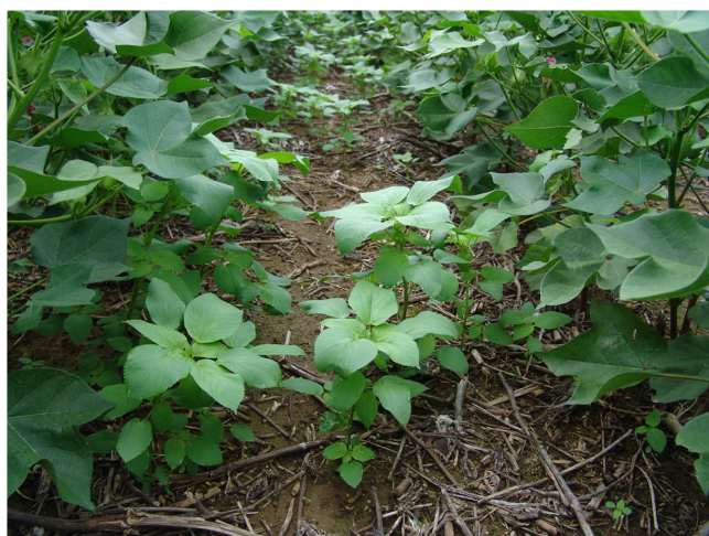
Hophornbeam copperleaf competing with cotton

hophornbeam copperleaf's round cotyledons. The first true leaves of hophornbeam copperleaf are opposite compared with the alternate true leaves of prickly sida. Additionally, the leaf margins of prickly sida are more coarsely serrated than the sharply serrated leaves of hophornbeam copperleaf. Copperleaf also lacks the small stipules (spines) in leaf axils that prickly sida has (Bradley and Rosenbaum 2011). A related species, Virginia copperleaf ( A. virginica L.) can be a troublesome weed species as well.