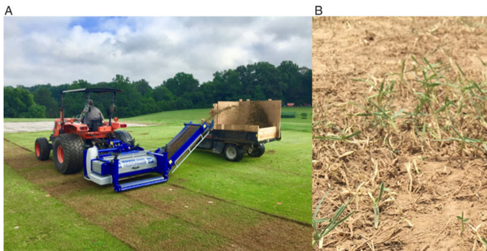
Figure 1. A. Demonstration of fraise mowing on zoysiagrass to remove aboveground biomass, thatch, and weed seed. B. Zoysiagrass regrowth from rhizomes and stolons not removed during fraise mowing.

during commercial crop harvest and prevent them from being redistributed into the soil seedbank (Walsh et al. 2013). Several methods of HWSC have been successfully used in cropping systems including 1) use of chaff carts to collect and remove debris (including weed seed) generated during harvest for off-site disposal; 2) use of a chute attached to a grain harvester to concentrate debris into a narrow windrow prior to being burned under appropriate environmental conditions; 3) use of a system to bale debris generated during harvest for transport off site; and 4) use of a cage mill mounted to a commercial harvester that pulverizes debris collected during harvest (Walsh et al. 2013). These techniques have been found to prevent 56% to 99% of annual ryegrass ( Lolium rigidum Gaud.), wild radish ( Raphanus raphanistrum L.), and wild oat ( Avena fatua L.) from being redistributed into crop production fields, with efficacy of narrow-windrow burning, baling debris, and use of a cage mill to pulverize debris, thus controlling seed lots 93% to 99% (Walsh and Newman 2007; Walsh and Powles 2007; Walsh et al. 2012).