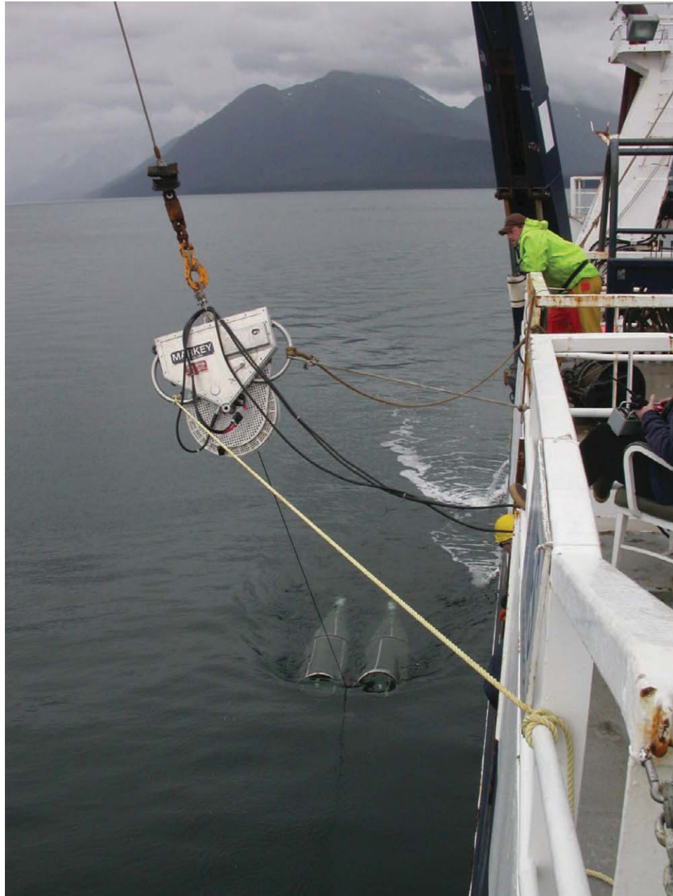
FIGURE 4. Bongo net being retrieved by the Sidewinder block winch suspended from the amidships boom on the 50-m charter FV Northwest Explorer . The remote control operator is partially visible at right, and the net is being retrieved through a “barn door” by the scientist in the yellow hardhat.

and internal level-wind are protected by an aluminum frame that also provides a watertight compartment for the electric motor controller and contains stainless-steel drive components for the level-wind. The electric motor in its watertight enclosure, the stainless-steel reduction gear box (Mulcahy 1981; Dempke and Griffin 1997), and the sealed electromagnetic motor brake (Figure 2) are located above the drum. The drum is driven by a self-lubricated chain and has capacity for 400 m of 4.8-mm-diameter lightweight, high-strength (2,500 kg) plasma soft-line