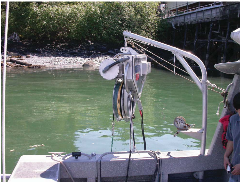
FIGURE 3. The Sidewinder block winch suspended from the davit of the 7-m RV Quest .

The low-voltage system led to several other design challenges because of the limited availability of low-voltage, lightweight, marine-grade components. The majority of existing components are mass-produced for specific customers, to be sold as part of a finished product. If components are available separately, technical information is often proprietary and is difficult or impossible to obtain. As a result, many components were used from other applications, including food processing machinery and battery-powered commercial vehicles such as fork-lifts and other indoor vehicles. The design was developed and built by Markey Machinery, and performance was verified through comprehensive shop-testing. Field tests were performed successfully on the RV Quest , and the final winch was later used throughout a survey on the 50-m charter vessel FV Northwest Explorer .