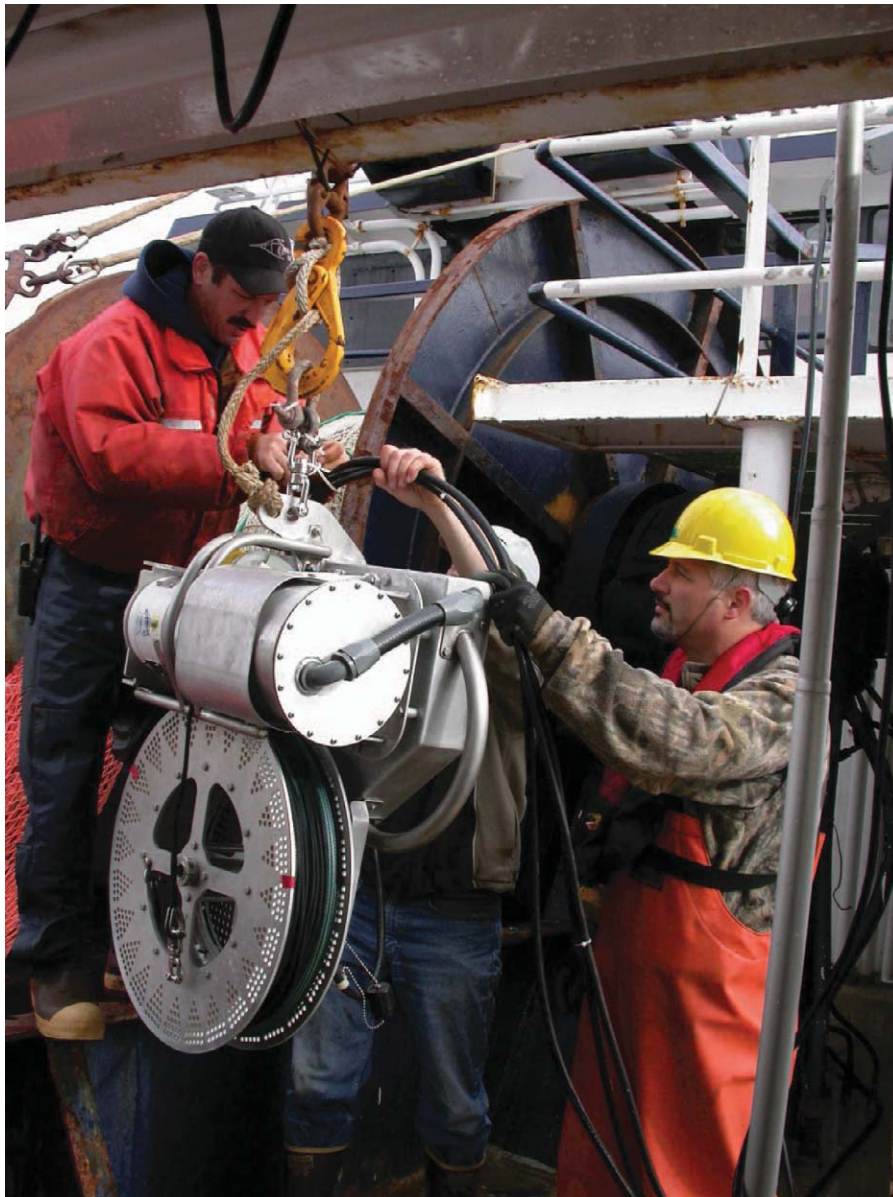
FIGURE 2. Photograph of the Sidewinder block winch showing the aluminum housing of the drum below the (left to right) planetary reducer, brake, line guide, and motor and the lifting handles above.

In contrast to the summer surveys, which include fish trawling, the SECM survey in May is restricted to oceanographic sampling for which the laboratory's 7-m RV Quest is of adequate size. The standard conductivity-temperature-depth (CTD) and vertical plankton net tows are readily accomplished using a hand line through a block, but the BONGO zooplankton net (about 45 kg) requires towing in a double-oblique trajectory to 200-m standard depths at a payout (deployment) speed of 1.0 m/s out and inhaul (retrieval) speed of 0.5 m/s (Orsi et al. 2004).