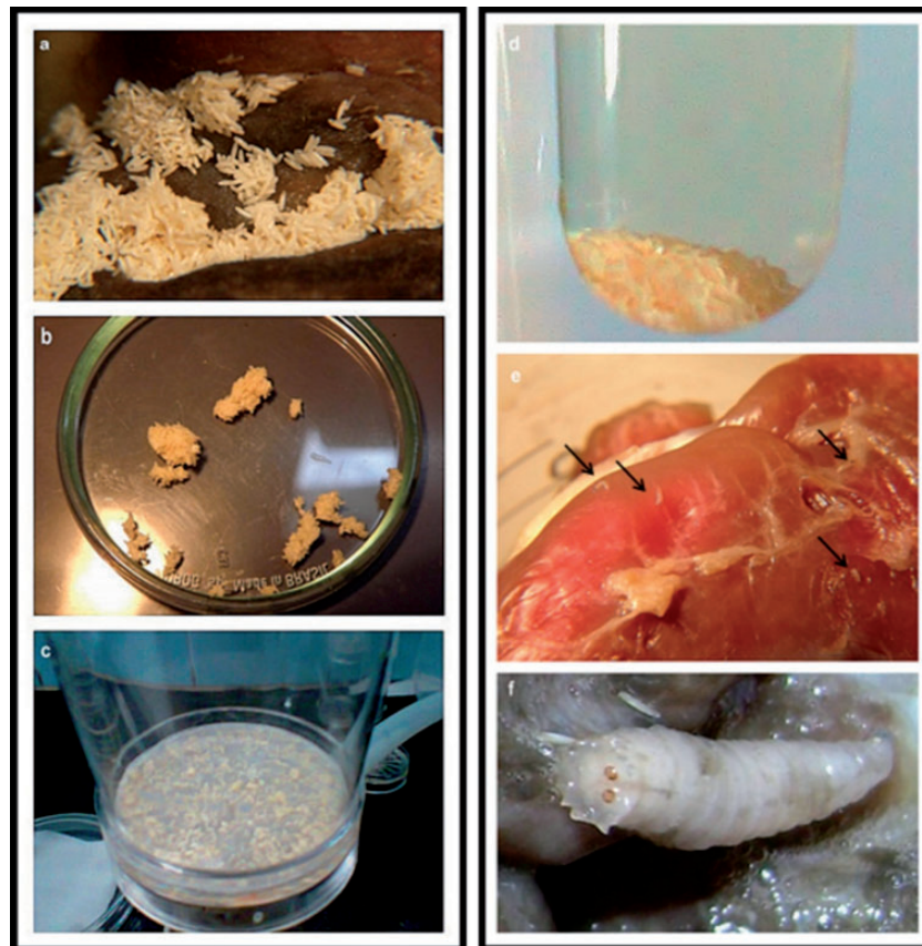
Fig. 1. Demonstrative scheme of the sterilization process sequence: (a) egg mass on chicken gizzard protein diet; (b) egg mass transferred aseptically to a Petri dish for weighing and separating for disassociation; (c) Bactor Sterile monitor filter cup and 0.8- \mu\text{m} Whatman filter paper with sterilized egg mass; (d) sample of sterilized egg mass transferred to test tube containing 10-ml TSB and FTB for the sterility test; (e) hatched larvae after 12 h transferred to chicken gizzard diet; and (f) larvae with normal development. Only the larva viability is shown in this study.

Egg masses from ninth generation female C. putoria of the stock colony were transferred, using sterile tweezers, to a microscope glass slide and then weighed on semianalytical scales until 0.600 g total weight was gathered and divided into three equal parts of 0.200 g. The parts were then transferred to sterile Petri dishes and mixed with 4 ml of sterile distilled water to disaggregate eggs that were separated mechanically using a no. 0 paintbrush. The egg suspension obtained was transferred aseptically to a test tube containing a 20 ml of 2% glutaraldehyde solution and activated by raising the pH to 8.0–8.2 with the addition of 0.4% sodium bicarbonate and 0.05% monobasic sodium phosphate. After 15 min of contact, the tube contents were filtered through a 0.8- \mu\text{m} thick, 2-cm diameter Whatman filter paper disc placed in a sterile plastic base (100-ml Bactor Sterile monitor cup), supported by a Kitasato flask. Immediately after filtration, the filter paper was rinsed with 30 ml of TSB to neutralize any glutaraldehyde residue that might have toxic effects on the eggs. Under aseptic conditions, the eggs were transferred to a gauze surface moistened with 0.9% sterile saline