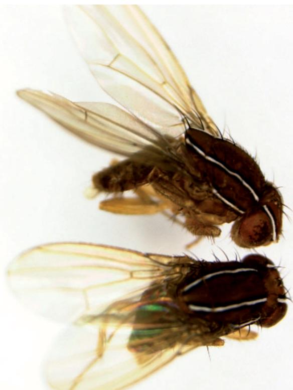
Fig. 1. Zaprionus indianus (adult specimens) collected from ACV traps in Adams County, Pennsylvania, during 2012.