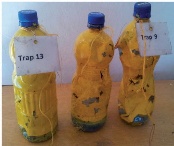
Fig. 1. Locally made fruit flies traps (donated by Arba Minch Plant Health Clinic).