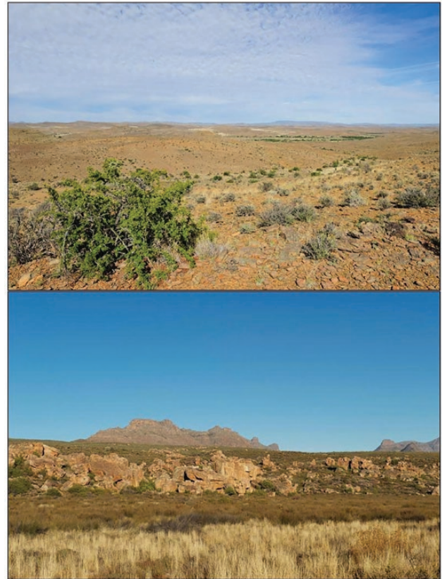
Fig. 4. —Typical Caracal caracal habitat on sheep farmland in the Central Karoo, Western Cape Province, South Africa (top). Typical C. caracal habitat in the Cederberg mountains, Western Cape Province, South Africa (bottom).

Though C. caracal is primarily nocturnal, activity levels are bimodal and depend on ambient temperature rather than photoperiod (Avenant and Nel 1998). Movement rates tend to increase more during nocturnal periods than the daytime (Ramesh et al.