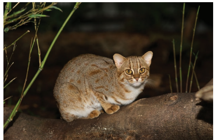
Fig. 1. —An adult female Prionailurus rubiginosus from the Rare Species Conservation Centre, Sandwich, United Kingdom.

CONTEXT AND CONTENT. Order Carnivora, suborder Feliformia, family Felidae, subfamily Felinae. Taxonomy of the leopard cat lineage of Asian small cats has been controversial for many decades, as evidenced by its long history of reclassification at the generic (e.g., Felis , Prionailurus , Viverriceps , Ictailurus Zibethailurus , Ailurogale , Ailurinus , and Mayailurus ) and species levels (Nowell and Jackson 1996; Kitchener et al.