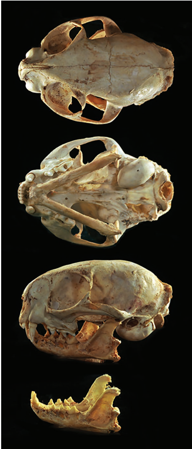
Fig. 2. —Dorsal, ventral, and lateral views of skull and lateral view of mandible of a female Prionailurus rubiginosus (Sri Lanka National Museum of Natural History registration number 38) from Katagamua southern province, 5.09.1933. Greatest length of skull is 61 mm.