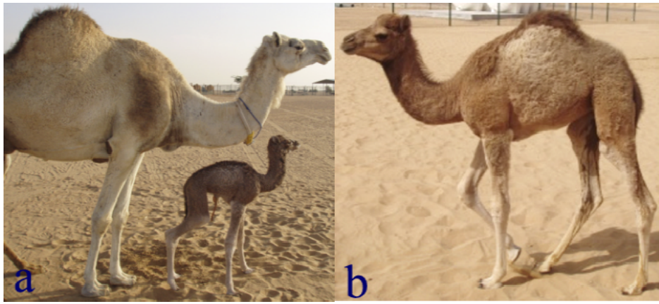
FIG. 3. The first cloned camelid, a female dromedary camel calf named Injaz: on the day of birth (a); and 2 mo old (b), growing well (photograph taken on 8 June 2009).

of the above-mentioned methods, assuming that the metaphase spindle was visible during the nucleation process. In our observations, dromedary camel oocytes are dark because of their high lipid content, like porcine and buffalo oocytes, making it impossible to see the metaphase spindle under an inverted microscope without an aid. The removal of oocyte chromatin prior to NT is of crucial importance in order to 1) avoid aneuploidy, with its detrimental effects on later development; 2) eliminate any genetic contribution of the recipient cytoplasm; and 3) exclude the possibility of parthenogenetic activation and embryo development without the participation of the newly introduced nucleus.