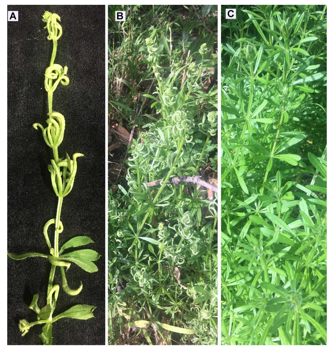
FIGURE 1. Cecidophyes rouhollahi and Galium aparine (St Johns, Auckland, New Zealand). A. Curled terminal leaves and expanded basal leaves of G. aparine (close-up view); B. Curled leaves of G. aparine in the field; C. Normal leaves of G. aparine .

predatory mites collected, we identified five species common in Auckland: Neoseiulus cucumeris (Oudemans, 1930); Amblyseius herbicolus (Chant, 1959); Amblydromalus limonicus (Garman & McGregor, 1956); Neoseiulella cottieri (Collyer, 1964); and Neoseiulella novaezealandiae (Collyer, 1964). No other phytophagous mites were observed on G. aparine . There seemed to be little doubt that the phytoseiids moved from other plants to this weed to take advantage of the super abundance of a new food source. Two of these phytoseiid species are important biocontrol agents and known to feed on eriophyids. Neoseiulus cucumeris could develop successfully on tomato russet mite, Aculops lycopersici (Massee), but failed to reproduce on this prey (Brodeur et al. 1997); whereas A. limonicus could feed and reproduce on a diet of this eriophyid mite (Houten et al. 2013).