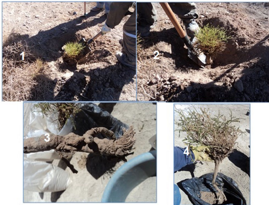
Figure 2. Photographic sequence of the extraction process of the specimens: (1) excavation of the delimiting furrow, (2) pruning of the plant, (3) extraction of a specimen, and (4) transfer of the specimen to a black bag.

VC in 1 kg of tailing (T2). In addition, for treatments T1 and T2 (T0 was not considered because it is the control treatment), the previously mentioned levels of mycorrhiza were considered: 0, 10, 15, and 20 g m -2 .