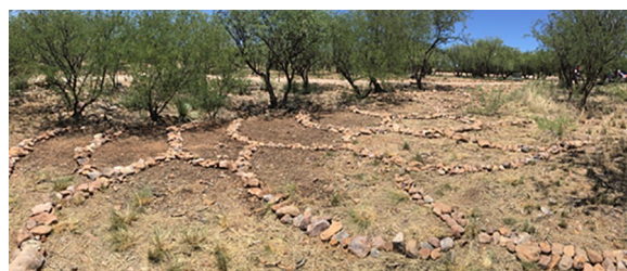
Image 8. Before image of Fishscale structure built on eroding slope.

In 2018, representatives from Baboquivari High School, Tohono O'odham Community College, and the Tohono O'odham Nation—a desert Indigenous community located along what is today known as the U.S./Mexico border—visited