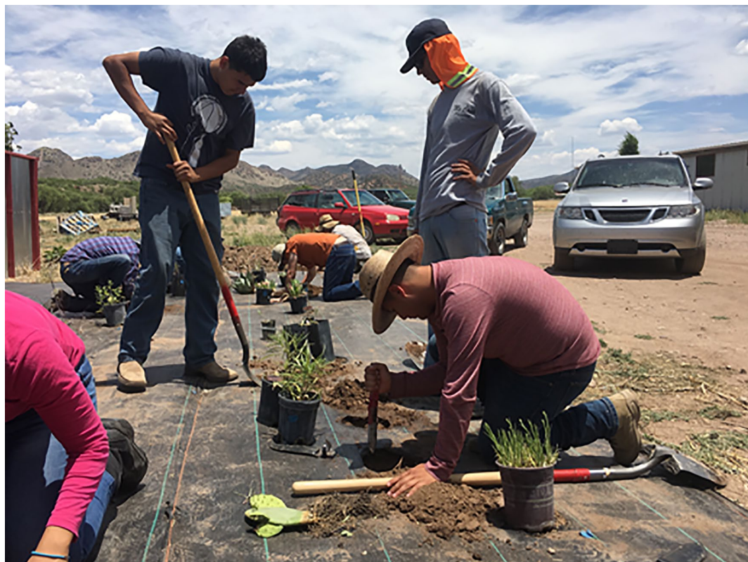
Image 5. BECY crew planting native flowers at Patagonia Flower Farm.