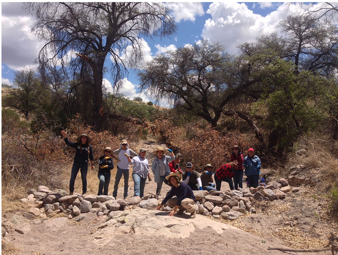
Image 1. BECY crew with rock structure.