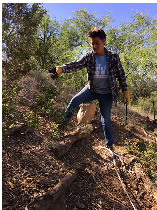
Image 6. BECY crew casts grass seeds on private ranch.