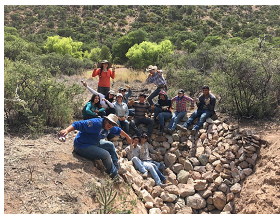
Image 7. BECY with giant Zuni bowl in Dragoon Mountains of Arizona.