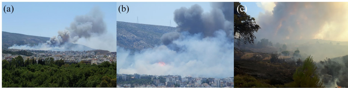
Figure 1. (a) A peri-urban fire on Mt Hymettus, in the outskirts of Athens, on July 17, 2015, with one fatality (Photo: G. Xanthopoulos), (b) a peri-urban fire on Mt Hymettus, in the outskirts of Athens, on July 17, 2015 (detail) (Photo: G. Xanthopoulos), and (c) fire in the rural area of Kalamos Attica Greece (summer 2017) (Photo: K. Stampoulidis).

area burned since 1991 was around 447 ha but only 283 ha between 2009 and 2018. Nevertheless, 2018 had the second highest forest area burned since 1991. The average area burned per fire generally around 0.5 ha. The current regional hotspot of wildland fires is in the region of Brandenburg with more than half of the area burned during the largest fires in 2018 (725 ha burnt only in August) and almost three times more than in the dry summer of 2003 when approximately 600 ha of forest has burnt in this federal state. This region is very prone to wildland fires as it has large proportion of connected forest area (44% of the forest is under protection, LFU Brandenburg), which are formed by pine monocultures on sandy soils, a particularly dry and flammable forest type. Since the industrialization, changes in forest management in several regions of former Prussia have replaced some of the previous and less-flammable forest dominated by deciduous trees (Dietze et al., 2019) by pine monocultures. This deep transformation was only possible by strong intervention into the hydrology, for example, building drainage ditches, which now are increasing drought problems, and thus fire susceptibility, in the mid mountain ranges.