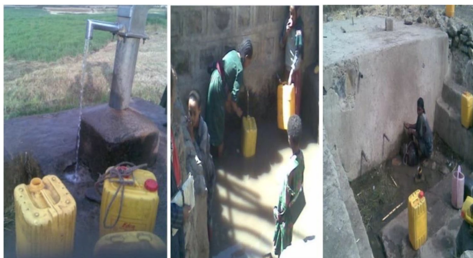
Figure 2. Status of improved water sources, and poorly managed (backflow, flooding, and broken).

tap water other sources indicates the incidence of fecal and total coliforms (14.3%). Whereas, 42.8% and 42.9% of the improved sources are under intermediate and high-risk classification. The two urban sources (Ur1 and Ur2) are included under the low-risk classification. Table 2 summarizes improved and unimproved water sources for total and fecal coliforms.