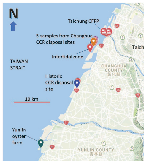
Figure 1. Locations of the 12 aquatic samples collected are pinpointed in the Google map for trace element contamination survey in Central Taiwan, including 3 near the Taichung CFPP, 5 from the Changhua CCR disposal site, 2 from the historic CCR disposal site, and 2 from the background seawater (intertidal zone and Yunlin oyster farm). CCR indicates coal combustion residual; CFPP, coal-fired power plant.

Taichung CFPP is the world's second largest operating power plant with an annual coal consumption of 21 million