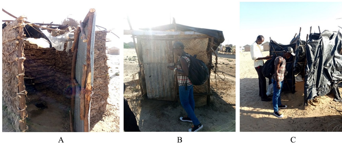
Plate 2. (A), (B), and (C) Nature of the latrines in the study area. 18