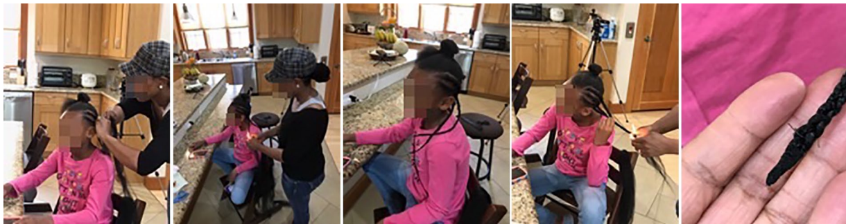
Figure 1. Photographs of volunteers demonstrating a typical braid-burning practice that is used during hair braiding to seal the tips of synthetic braids and prevent unraveling. Used with permission (Auguste et al, in preparation, 2020).

exposure. Zhong et al 10 also examined VOCs in 17 nail salons. They measured personal inhalation exposure using passive samplers attached to clothing, and they measured area exposure using passive samplers in a backpack. They analyzed 35 nail salon products with a static headspace gas sampling method. All collected samples were analyzed with GC-MS protocols. They found that personal inhalation exposure to VOCs was 1.2 to 2.0 times higher than area exposure. They identified specific nail salon products that contributed to VOC measurements of ethyl acetate, propyl acetate, butyl acetate, n-heptane, and toluene found in most of the 17 nail salons. Hadei et al 11 measured concentrations of benzene, toluene, ethylbenzene, xylene, formaldehyde, and acetaldehyde in beauty salons, finding possible cancer risks from benzene, formaldehyde, and acetaldehyde. However, none of these researchers looked at synthetic hair.