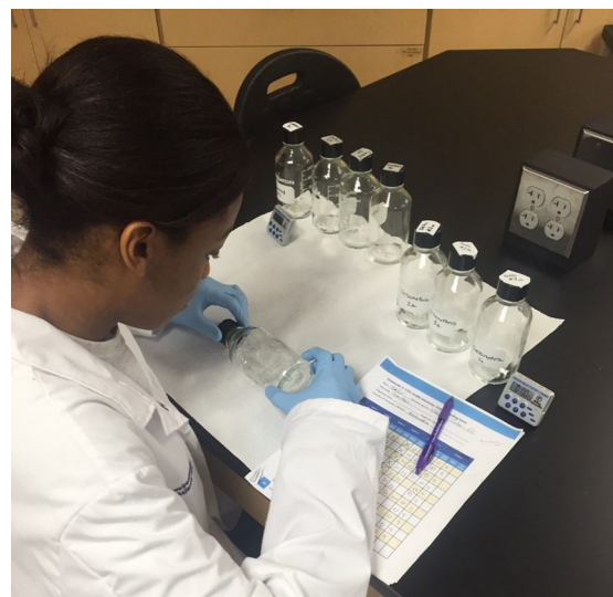
CDC bottle bioassay.

Centers for Disease Control and Prevention