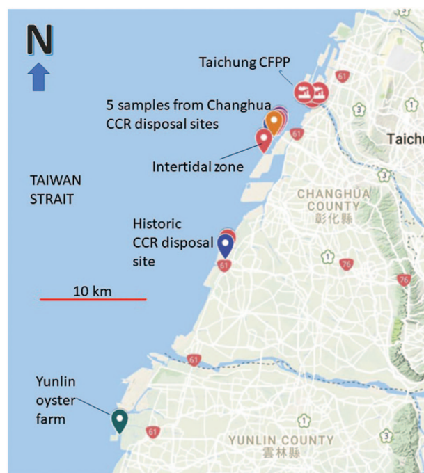
Figure 1. Locations of the 12 aquatic samples collected are pinpointed in the Google map for trace element contamination survey in Central Taiwan (Map data ©2018 Google), including 3 near the Taichung CFPP, 5 from the Changhua CCR disposal site, 2 from the historic CCR disposal site, and 2 from the background seawater (intertidal zone and Yunlin oyster farm). CCR indicates coal combustion residual; CFPP, coal-fired power plant.

Taichung CFPP is the world's second largest operating power plant with an annual coal consumption of 21 million