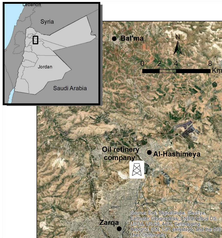
Figure 1. Study sites laid over a satellite imagery provided by ESRI (courtesy of Dr. Rana Jawarneh).

country. 14 The oil refinery produces air pollutants through its processes of fuel combustion, especially the emitted sulfur dioxide, nitrogen oxides, carbon monoxide, sulfide hydrogen besides black carbon. 15 The current study aimed at assessing the reported health status and perceptions of health status among populations living near the oil refinery (Al-Hashimeya) in comparison with another town which is further away from that area (Bal'ma).