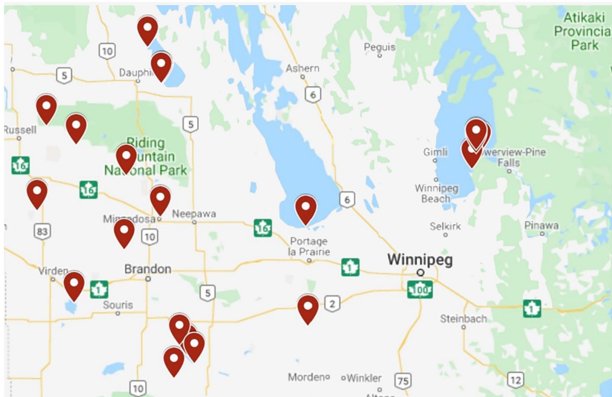
Figure 1. Screenshot of publicly-available map of HABs occurrence across Manitoba in 2019. 73,75

(DH), the responsible organization in association with local health advisors. 42,76