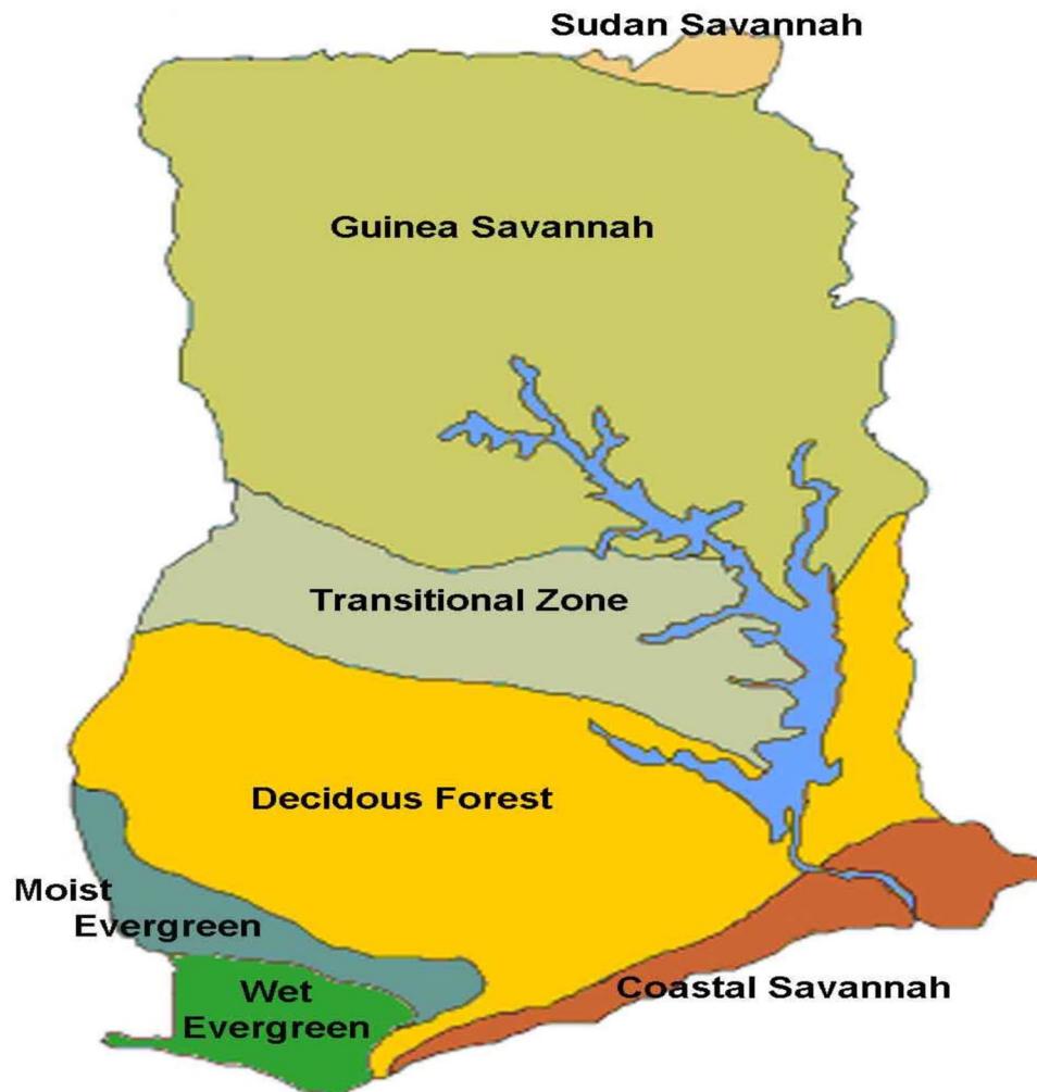
Figure 1. Map of agro-ecological zones in Ghana.

Amponsahkrom and Ayigbe representing Wenchi Municipality of the BR and Deideiman area and Otsirkomfo representing Ga West Municipality of the GAR.