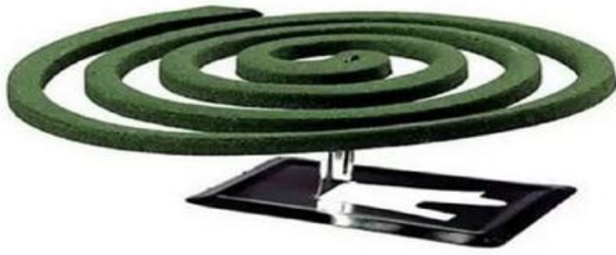
Plate 1. A typical spiral-shaped mosquito coil.

When a mosquito coil is burnt, it emits repelling incense that keeps away mosquitoes. The coil usually contains an active ingredient which may vary from one brand to another. It is commonly made into a paste that is dried and given spiral shape as shown in Plate 1. The coils are used widely in the developing countries including Nigeria to repel and kill mosquitoes most especially in the summer when hot weather aids their breeding in large quantities. 14,17 Emissions from mosquito coils have been linked with release of harmful pollutants. 14,16 This is even more worrisome and of great concern as humans are at the risk of being exposed to high toxic loads of the pollutants because they are usually released into indoor environment which in most instances have poor ventilation and the pollutants from their ashes into outdoor environment (soil and water bodies). Different brands of mosquito coils (imported or Nigerian made) are available for use in Nigerian markets. These coils are usually burnt at night in the bedrooms while household members sleep.