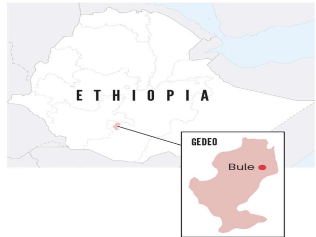
Figure 1. Map of the study area.

A quantitative community-based cross-sectional study design was employed to determine the magnitude of household-level water treatment practice and associated factors among households in Bule town, Southern Ethiopia. The town is 387 km from Addis Ababa and 27 km from the Dilla town administrative center (zonal capital). According to a 2007 census projection, the town has 3 urban kebeles (the smallest administrative unit) with a total of 8873 households. 20 The study was conducted during the period of October 15 to November 5, 2021 G.C. All households in the town were the source population, and all households selected using systematic random samplings were considered as the study population. The study included respondents who were 18 years or older (preferably female) and had lived in the town for at least 6 months, and excluded participants who were critically ill and unable to communicate in order to submit information (Figure 1).