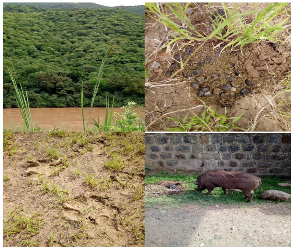
Figure 2. Forest, dung and hoof print of hippo and warthog observed downstream to Ghibe-III dam.

upstream to downstream to the less ecologically disturbed due to less human intervention. On contrary, monkeys, and apes significantly increased and moved into human settlement areas. In Kindo Didaye, which is located downstream from the dam, respondents confirmed there is a significant change in wildlife population, especially following seasonal trends due to natural phenomena and dam construction. During the rainy season when green grass occupies the area, some of the wildlife resumes their original place. Warthog, Hoof print of buffalo and hippo,