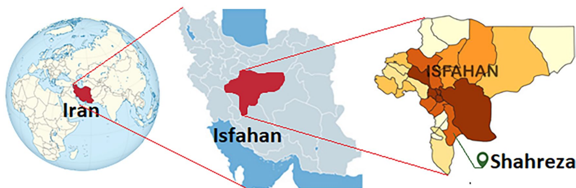
Figure 1. Geographical location of Shahreza in Iran.