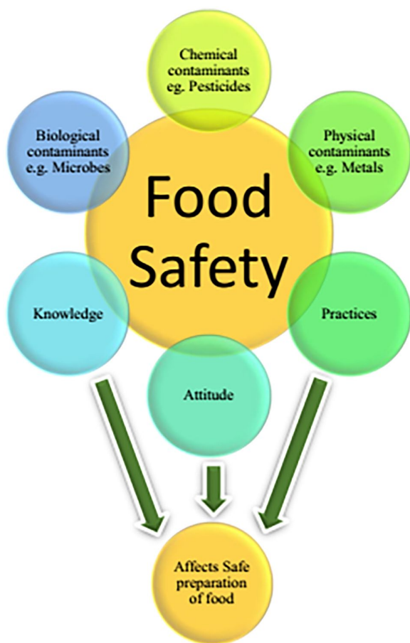
Figure 2. Factors that determine the safety of foods.

caffeine to most drinks or caffeine substances to boost alertness in consumers. 69 Some food handlers also have very poor personal hygiene, poor environmental sanitation, and prepare food in contaminated environments, shocked gutters, and other