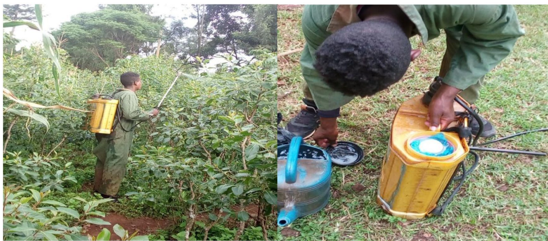
Figure 3. Pesticide mixing and spraying practice at Malga District Sidama regional state.

The utilization of pesticide for 10 years and longer [AOR = 6.743, 95% CI: 3.569, 12.738] and used between 6 and 10 years [AOR = 1.913, 95% CI = 1.166, 3.141] had higher odds of safe utilization of pesticides than the study participants with less experience. Furthermore, the source of pesticide bought from agricultural office [AOR = 6.996, 95% CI = 3.585, 13.653] and bought from nearby shop and supermarkets [AOR = 2.312, 95% CI = 1.360, 3.930] had high odds of safe practice of