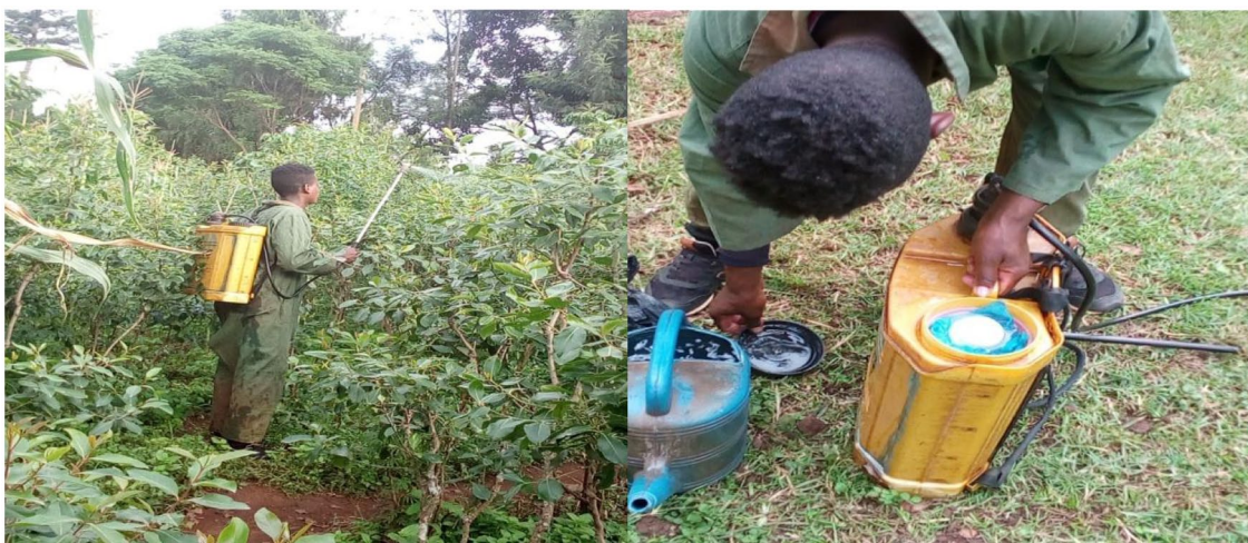
Figure 3. Pesticide mixing and spraying practice at Malga District Sidama regional state.

The utilization of pesticide for 10 years and longer [AOR = 6.743, 95% CI: 3.569, 12.738] and used between 6 and 10 years [AOR = 1.913, 95% CI = 1.166, 3.141] had higher odds of safe utilization of pesticides than the study participants with less experience. Furthermore, the source of pesticide bought from agricultural office [AOR = 6.996, 95% CI = 3.585, 13.653] and bought from nearby shop and supermarkets [AOR = 2.312, 95% CI = 1.360, 3.930] had high odds of safe practice of