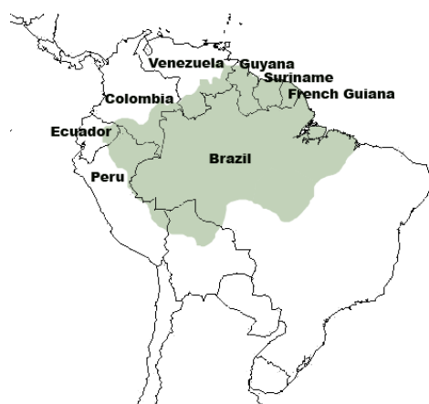
Fig. 1. The Amazon Basin in South America is comprised of areas of Brazil, Bolivia, Peru, Ecuador, Colombia, Venezuela, Guyana, Suriname, and French Guiana. Approximately 4,100,000 square kilometers (50%) of the forested area is located in Brazil

One of the consequences of deforestation is forest fragmentation, an ever-increasing global phenomenon affecting the persistence of healthy forest ecosystems across the planet [9]. Forest fragmentation occurs when sections of contiguous forest are cleared, thereby leaving a mosaic of patches surrounded by a non-forested matrix. As deforestation for agriculture or urban development continues, the remaining forest becomes increasingly patchy, affecting local climate [10, 11], species richness and distribution [10, 12, 13], predator-prey interactions [14], seed dispersal [15, 16], and habitat suitability [17, 18].