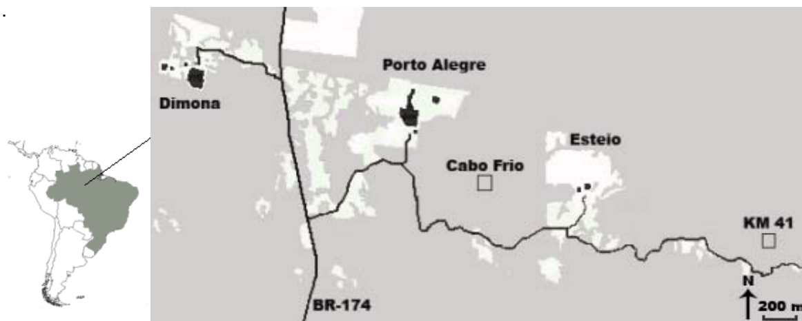
Fig. 3. The Biological Dynamics of Forest Fragments Project (BDFFP) is located approximately 80 km north of Manaus, the capital of the state of Amazonas. Forest fragments are located throughout three cattle ranches, or fazendas , Dimona, Porto Alegre, and Esteio. Cabo Frio and Km 41 are two continuous forest sites. Fragments are black, clear-cut areas and secondary forest areas are white, and old growth forest is gray. The SUFRAMA colonization plan would settle families within the area of BDFFP

Six primate species reside in the BDFFP study area: red howler monkey ( Alouatta seniculus ), black spider monkey ( Ateles paniscus ), brown capuchin monkey ( Cebus apella ), brown bearded saki ( Chiropotes satanas chiropotes ) 1 , white-faced saki monkey ( Pithecia pithecia ), and golden-handed tamarin ( Saguinus midas ). Although research at BDFFP has been ongoing since 1979, primate research in the forest fragments has been sporadic, with in-depth behavioral and ecological research only on red howler monkeys [35-40], white-faced saki monkeys [41-43], and bearded saki monkeys [44]. Therefore, there is still much to learn regarding the responses of the primates to forest fragmentation.