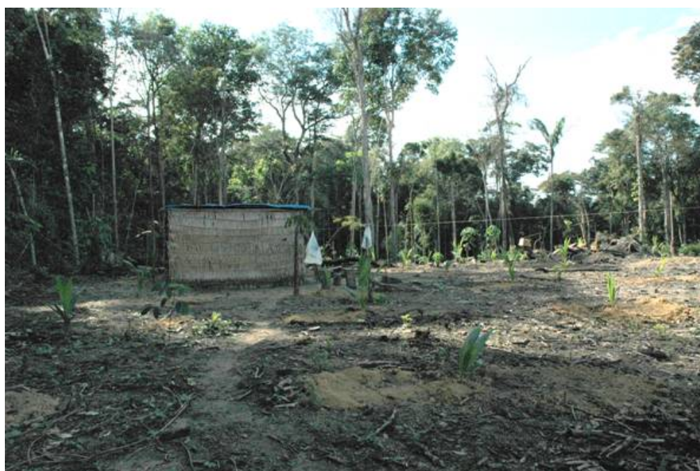
Fig. 4. Settlers within the Biological Dynamics of Forest Fragments Project (BDFFP) study area have illegally cut native forest. Theft, hunting, and intentional fires have also posed problems to the BDFFP. This photograph depicts one settlement in July 2007.

The possible demise of the BDFFP, a research site that spans three decades, would be a great scientific and educational loss. Approximately three decades of research have been conducted at the BDFFP, yet the BDFFP has also been a source of employment and educational opportunities ( e.g. , training in science and management) for local residents, for Brazilians from other areas of the country, and for the international community [7, 46]. Past and present BDFFP researchers have also partnered with other agencies to work with the rural population on agroforestry projects ( e.g. , education, training, distribution of native seedlings), and to provide educational materials on how to make a living without disturbing the protected areas (R. Luizão, pers. comm.). Scientists also credit the cooperation between the local landowners and the BDFFP researchers for the success of the BDFFP project [45]. Therefore, increased human colonization of the study area threatens all aspects of the BDFFP, including the conservation of the primates in the area.