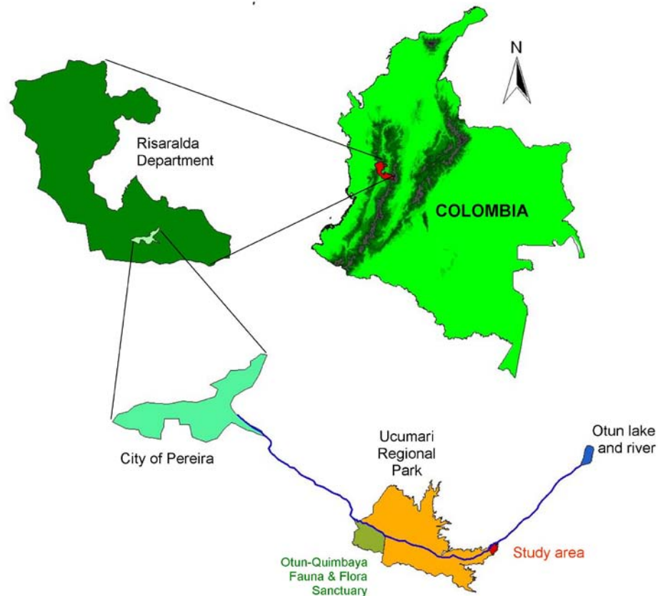
Fig. 2. Location of the study area on the western slope of the Central Andes of Colombia, east of Pereira.

control, to secure a constant and clean supply of water for a growing urban and rural population [22]. At the upper elevations, 2,400 to 2,600 m, monospecific stands of alder and other tree species were planted throughout the landscape. These stands were not managed and are presently overgrown with native vegetation, although the canopy is monodominant. As a result of this restoration program, 4 to 10 ha patches of alder-dominated and naturally regenerated and old-growth mixed forest lie intermingled on the foothills and valley bottom, in an area of 66 ha.